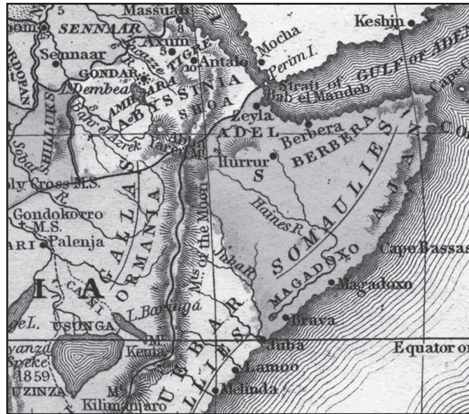
Map 1: Oromia in the 1850s