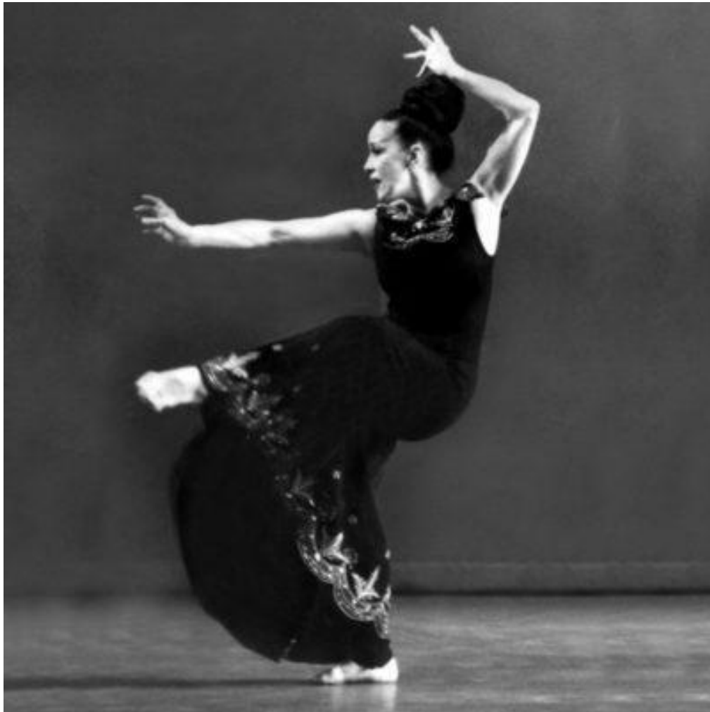
Figure 1: Martha Graham, Clytemnestra