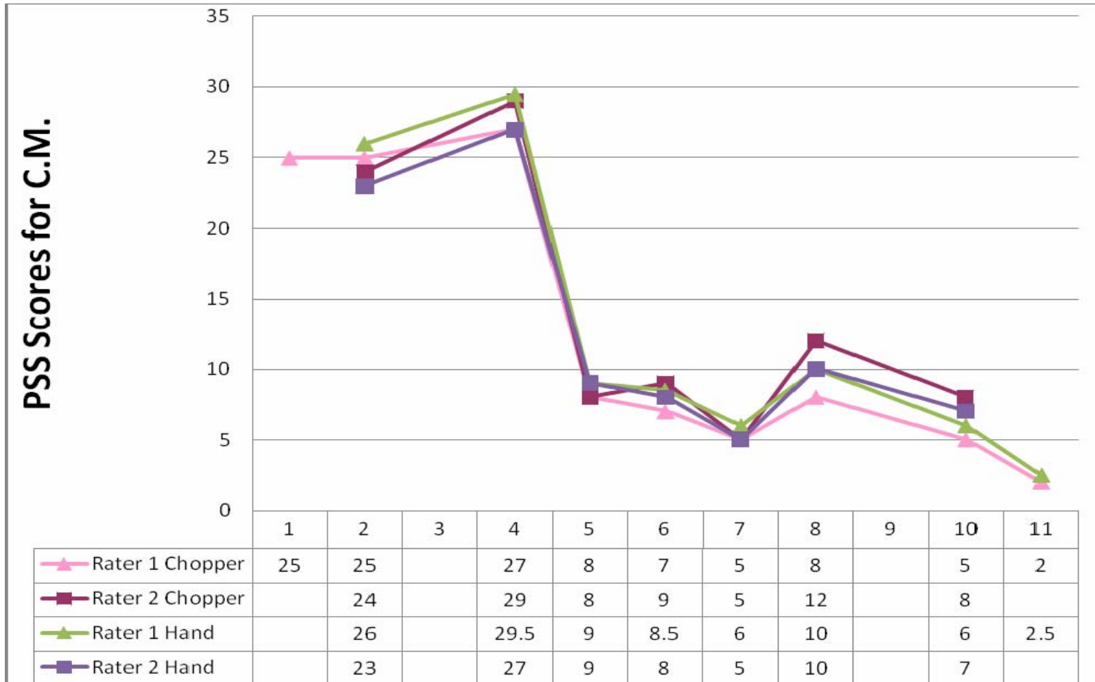
Figure 2: PSS Counts of Rater 1 and Rater 2 using the Chopper fluency program and hand counting methods