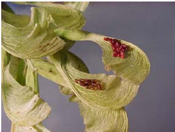
Figure 2. Red boxelder bug eggs on a boxelder samara.