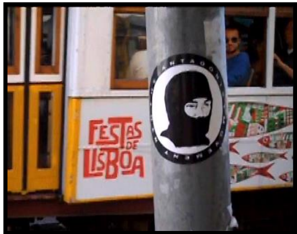
Figure 9. Film Still: The Dolls of Lisbon . A Sticker Placed On a Street Pole.

Current members of the AAM place stickers at home and abroad (personal observation). Promoting the AAM brand by placing stickers in public places (walls, benches, posts, etc.) disrupts normative notions of public space (i.e. clean and visually uncluttered) (Cresswell 1996). Claiming spaces for public expression and using images or rooms to show art is simultaneously art-making and place-making (Gregson and Rose 2000). In this activity, the AAM explores the myriad ways in which art shapes and challenges banal spaces. As the AAM community continues to expand, members around the world place its stickers on spaces in their hometown and as they travel. This marks the space with unprecedented art, which challenges ideas of the function of public space, the ways in which artists find a voice, and how art in public space is experienced.