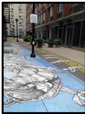
Figure 5. A Street Mural Behind CBGB Commemorating Joey Ramone.

An example of AAM collaboration in NYC is the murals that some AAM artists paint on city blocks. The most recent mural completed was a collaboration between the AAM and the Fourth Arts Block (FAB NYC). FAB NYC is a collaboration between cultural and community groups that aims to promote the fourth arts block between 2 nd street and the Bowery in lower Manhattan (FAB 2001). The AAM collaborated with FAB to create a street mural on Essex Place, behind the previous location of CBGB (Country, BlueGrass, and Blues). CBGB was a music venue that was famous for its role in the punk rock scene of the 1970s, and Patti Smith and the Ramones performed there. The mural was inspired by a poem that Dee Dee Ramone wrote about his brother Joey Ramone (Greenberg 2013; Nathan 2013). The lead AAM artist for this project was an artist from Ecuador who visited NYC for an extended trip. While he was in NYC, the AAM helped him find a job assisting an established artist, a place to live, and encouraged him to participate in the mural project. The collaboration on the Essex Place mural created a space that was local and international, as two NYC groups organized the project and it was completed by an Ecuadorean artist.