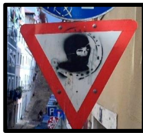
Figure 8 Film Still: The Dolls of Lisbon. A Logo On a Street Sign in Lisbon.

These stickers are stuck on public spaces by Antagonist-affiliated artists wherever they travel. Stickers are easy to place on a wall when compared to spray paint (Dickens 2008a), which helps the artist avoid the policing of public spaces and provides more flexibility with where an image can be placed. Stickers have a set picture, are lighter to carry than paint, and the exact same design can be placed at multiple locations. In addition, stickers maintain a consistent brand that viewers can recognize, assert group identity, and agency (The Antagonist Art Movement 2004; Reid 2013). Spray paint is sometimes used to place the AAM logo, however the paint is bulky to carry and takes some time to use when creating a sign or picture (Dickens 2008a). Regardless if stickers or spray paints are used, an unplanned image interrupts the space in which it is placed (Cresswell 1996), while promoting a brand of an artist. In this way, the AAM challenges the demands that communication in and around public spaces be controlled by a few.