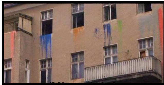
Figure 13. Film Still: This is Berlin, Not New York. Paint is Poured From the Top Floor of an Abandoned Building..