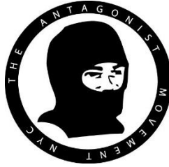
Figure 7. The AAM Logo.

These stickers are stuck on public spaces by Antagonist-affiliated artists wherever they travel. Stickers are easy to place on a wall when compared to spray paint (Dickens 2008a), which helps the artist avoid the policing of public spaces and provides more flexibility with where an image can be placed. Stickers have a set picture, are lighter to carry than paint, and the exact same design can be placed at multiple locations. In addition, stickers maintain a consistent brand that viewers can recognize, assert group identity, and agency (The Antagonist Art Movement 2004; Reid 2013). Spray paint is sometimes used to place the AAM logo, however the paint is bulky to carry and takes some time to use when creating a sign or picture (Dickens 2008a). Regardless if stickers or spray paints are used, an unplanned image interrupts the space in which it is placed (Cresswell 1996), while promoting a brand of an artist. In this way, the AAM challenges the demands that communication in and around public spaces be controlled by a few.