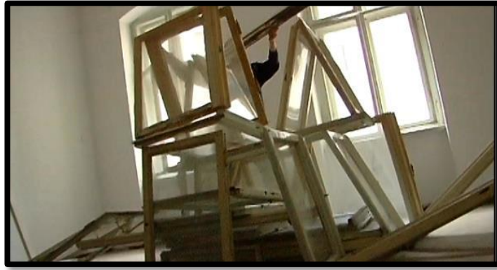
Figure 12. Film Still: This is Berlin, Not New York. A NYC Artist Creates a Sculpture of Windows in an Abandoned Building.

a rainbow of colors on the sidewalk. Only when pedestrians stopped to notice the splatter and then look up, would they see that the abandoned building was used as a space for art as well as an artwork itself.