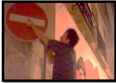
Figure 11. Film Still: The Dolls of Lisbon. An Artist Places a Sticker on a Street Sign in Lisbon.