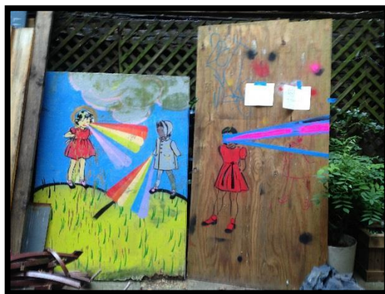
Figure 6. Works in Progress Behind the AAM bar.

Engaging with participants at the bar allowed me to see first-hand and experience the inclusive community that the AAM works to encourage. In addition, I witnessed the results of AAM efforts when I visited an art show by AAM artists and two AAM murals in the East Village.