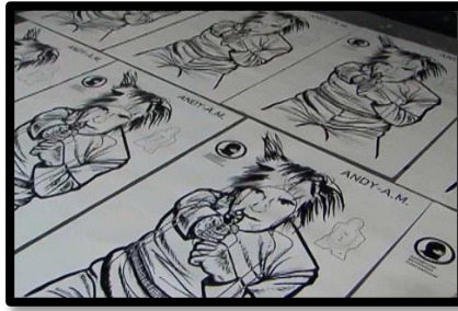
Figure 3. Film Still: The Dolls of Lisbon. Andy Warhol