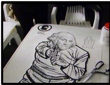
Figure 4. Film Still: The Dolls of Lisbon. Artists Paste on the Target the Face of the U.S. Dollar Bill.

However, the main goal of the AAM is to provide artists with an exhibition place to show art and provide peer support to freely create whatever they desire (The Antagonist Art Movement 2007c; The Antagonist Art Movement 2013; The Antagonist Art Movement 2007a). The art that the AAM shows is not required to conform to a particular kind of political leaning.