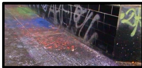
Figure 14. Film Still: This is Berlin, Not New York. Paint Splatter on the Sidewalk from the Building Above.