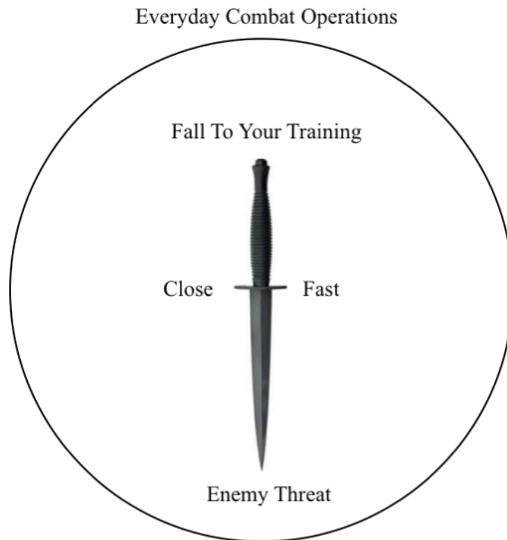
Figure 2. Icon of Thematic Structure

In Figure 2 the knife handle represents the participant's figural body as the product of training that emerges in the theme fall to your training . The knife blade connects with the various figural aspects of others (i.e., enemy combatants) to highlight the physically violent and aggressive interaction between participant and opponent. The relatively short ends of the knife cross guard represent figural portions of the existential themes of time and world during hand-to-hand combat. The small size of the cross guard ends, relative to the size of the blade and handle, coincide with the short amount of time comprising combat (i.e., fast ) and the immediate physical proximity to the combatant (i.e., close ).