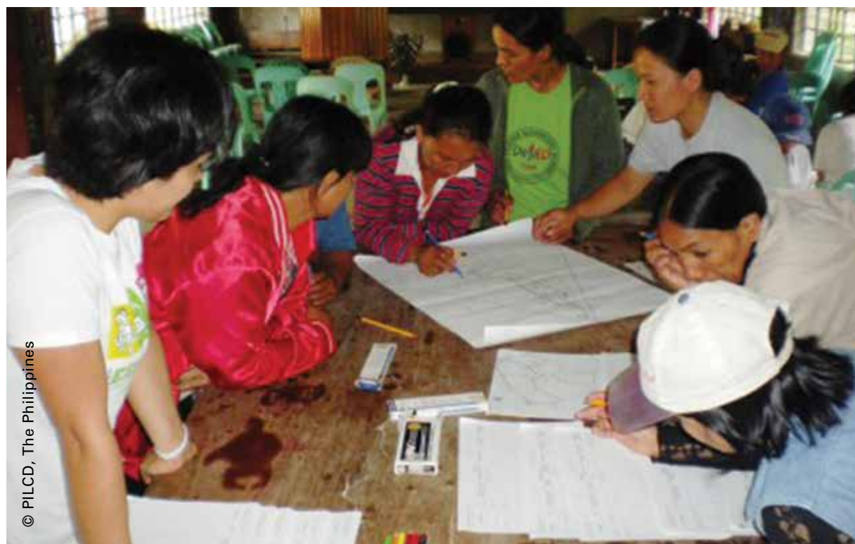
Community members doing hazard mapping