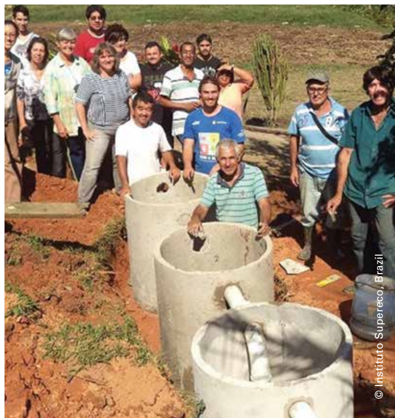
Community working on a biogas plant in Caraguatatuba