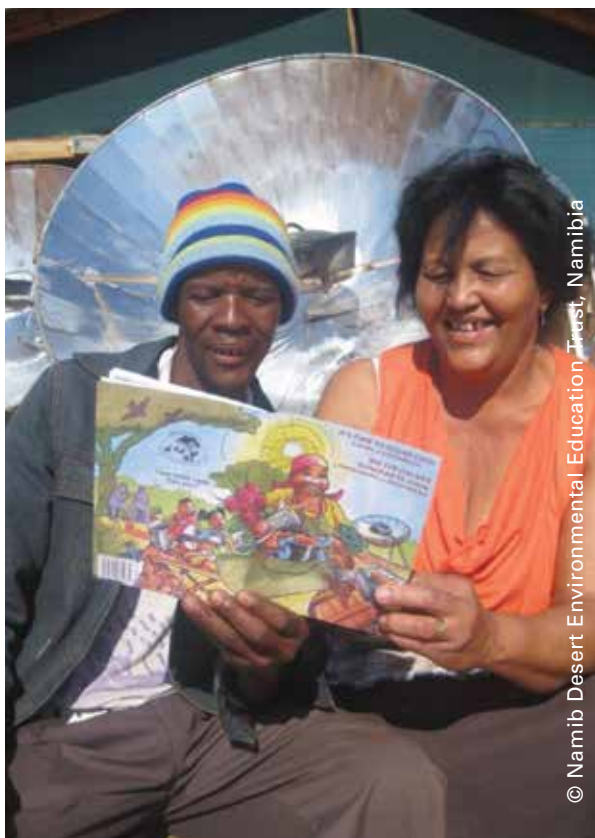
Adults enjoy reading an educational book