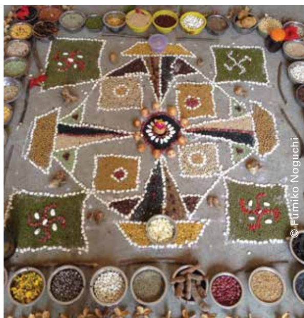
Mandala made by a women's group with locally grown agricultural products

Gram Nidhi successfully embedded a more holistic approach to learning within the very specific micro-finance project. Capacities of socially marginalized women were enhanced so that they could design their own eco-enterprise project and carry out their business successfully and sustainably. They were empowered through the project to develop confidence and independence which they had previously lacked.