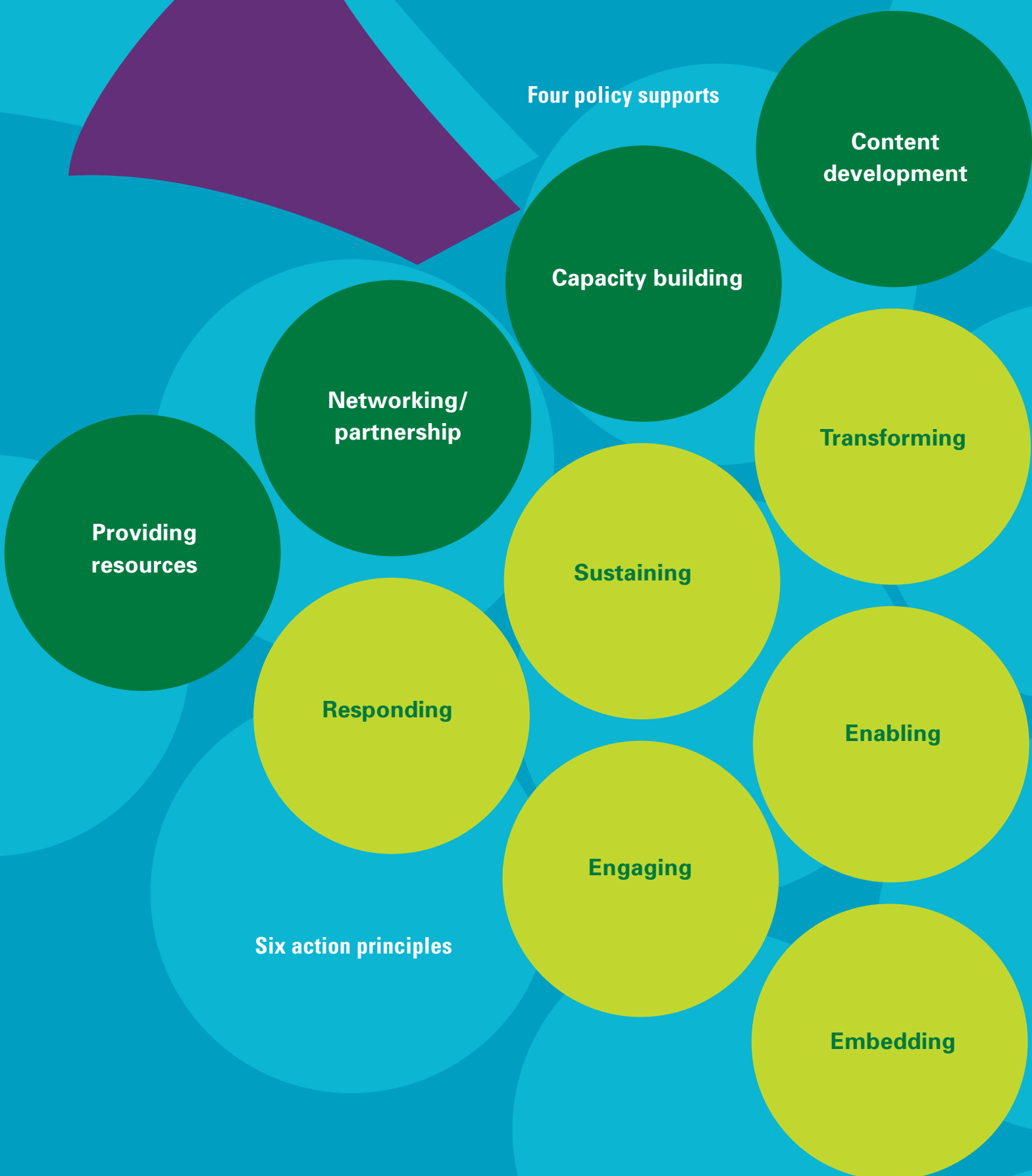
Figure 1: Action principles and support mechanisms