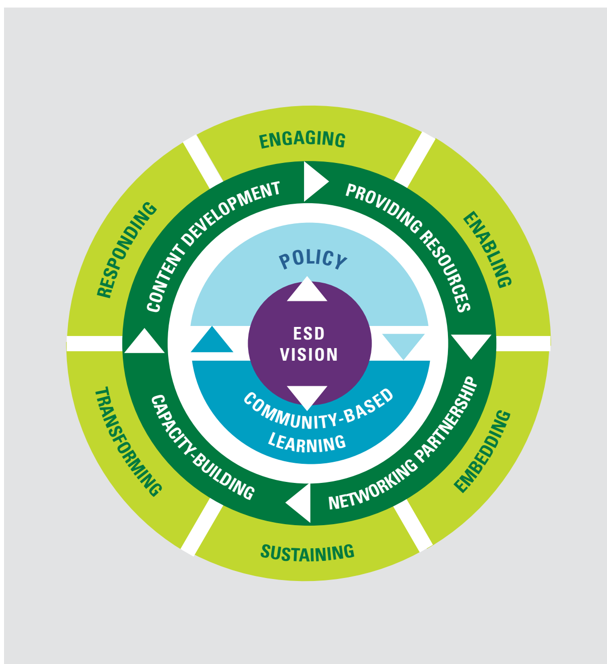
Figure 3: Six action principles and four policy support mechanisms

To complete the picture, the Okayama Commitment clearly outlines that the six interrelated action principles require ongoing support in order to achieve the long-term vision of ESD, which can be provided through policy mechanisms. Each of the ESD practice case studies have identified specific policy support mechanisms that contributed to their successes.