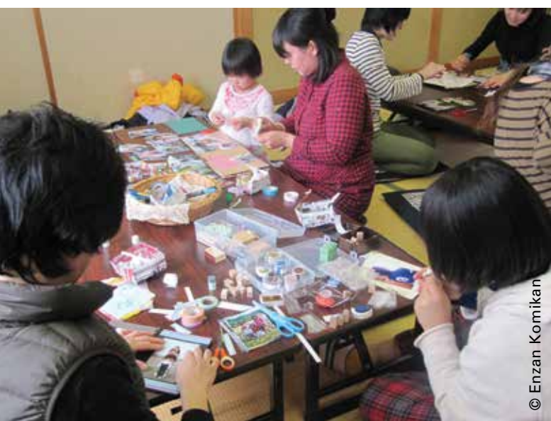
Intergenerational learning activities