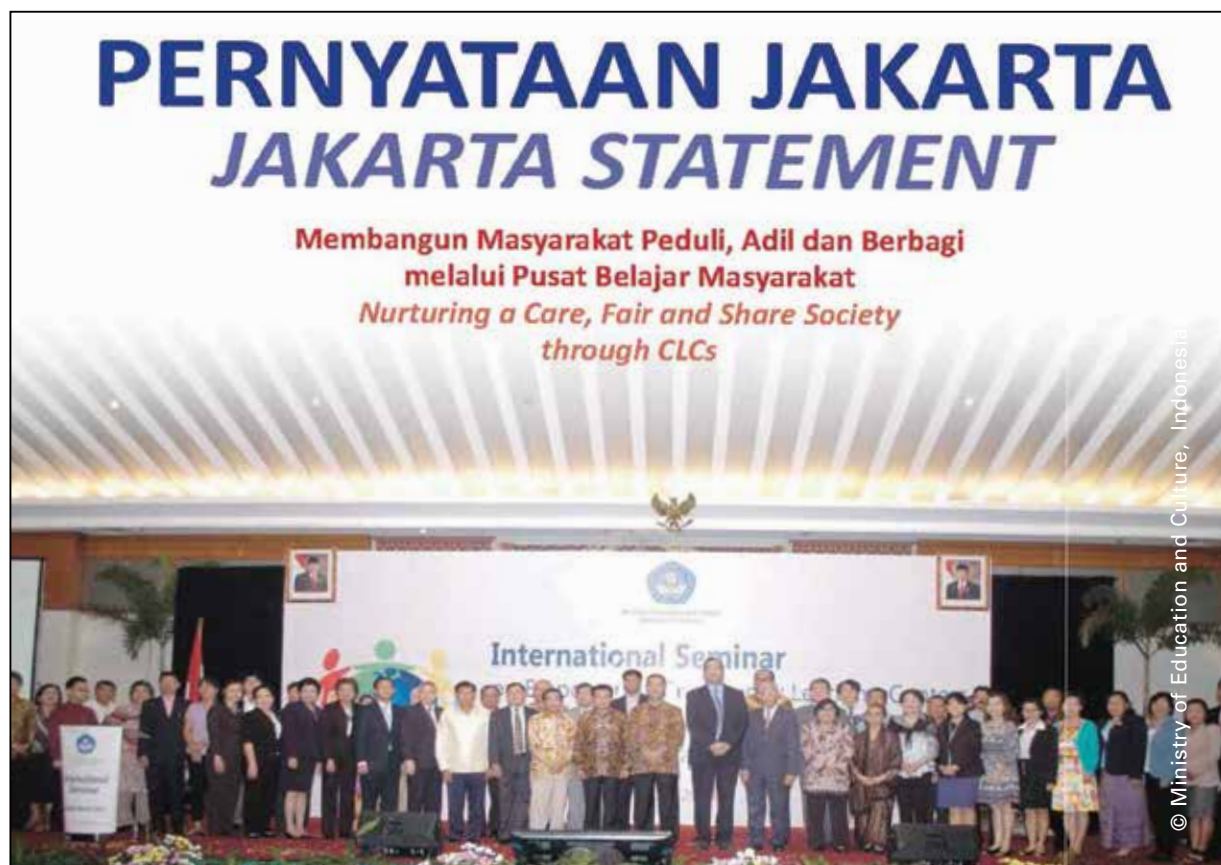
Discussing the process of drafting the Okayama Commitment