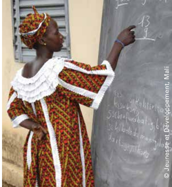
Circle member practicing numeracy

Of the 314 circle members who took literacy assessment, the majority achieved advanced literacy levels (120 women and 41 men). In monetary terms, villagers made substantial profit by producing and selling local soap and dyed clothes and by increasing their maize production.