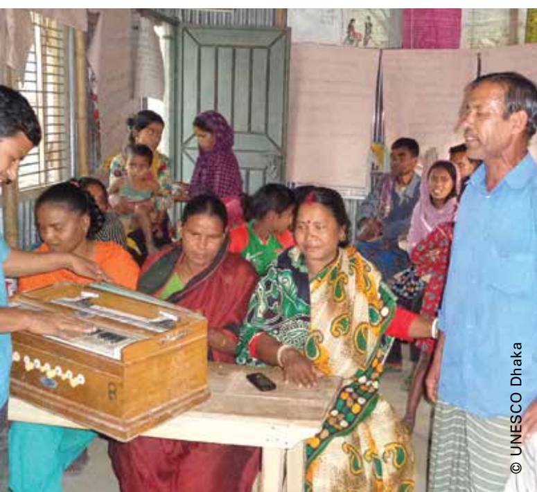
Safeguarding and promoting local traditional culture in CLC