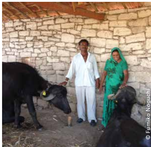
A farmer couple showing their indigenous cows purchased with microfinance credit

Gram Nidhi activities have resulted in positive transformation of the local communities. The socially marginalized people have developed pride in themselves and their communities by re-evaluating local knowledge and re-establishing the community network.