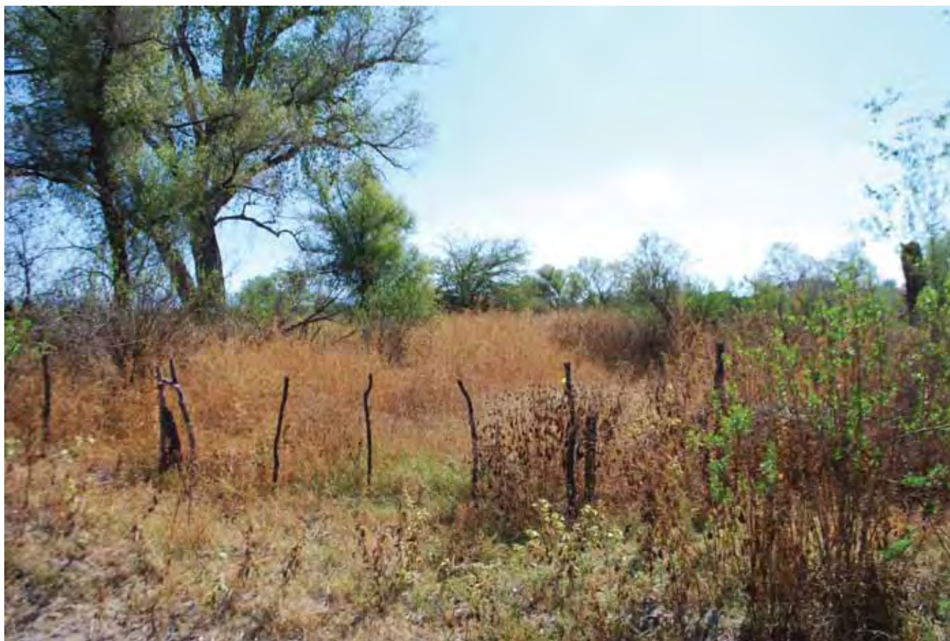
Fig. 12. Small fields, waste corners, and copses of riparian vegetation just upstream from the village of Bacoachi, Sonora, in October 2011. Despite this area's appearance of being ideal quail habitat neither bobwhite nor Gambel's quail were heard or seen leaving one to wonder if local trapping might be impacting their numbers.

due to delayed water development and year-long livestock use (Tomlinson 1972a). Rancho Carrizo and its environs, while the site of some of the most recent observations, were not necessarily the best habitat, but one of the last habitats to be exploited. Unfortunately, this site in Mexico may no longer support masked bobwhite, as no birds have been detected on surveys here within at least the last 3+ years (Dan Cohan, personal communication). The prime habitats for masked bobwhites occurred near the center of the bird's distribution, where most birds were collected (Fig. 1, Appendix).