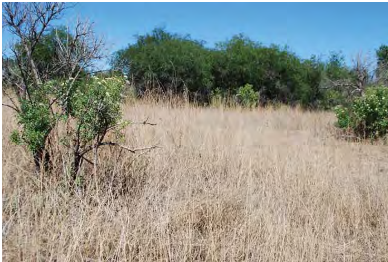
Fig. 10. Calabasas—this site at an elevation of 1,058 m is where the last masked bobwhites were collected in Arizona in 1897. It is June and the Mexican elder-berries ( Sambucus mexicana ) are flowering at this historic location, which was recently burned and will soon be converted to an industrial park.

by woody species because of overgrazing by livestock and a lack of fire.”