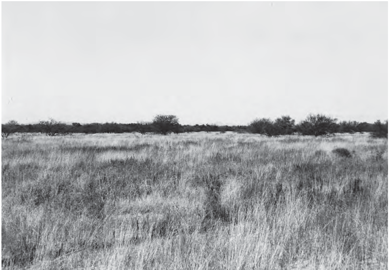
Fig. 6. Rancho Carrizo's llanos as they appeared in 1966 and described by Tomlinson (1972b). Photograph by D. E. Brown taken in 1968.

in good grass searching for bobwhites but failed to find any—the area he described being close to 1,220 m.