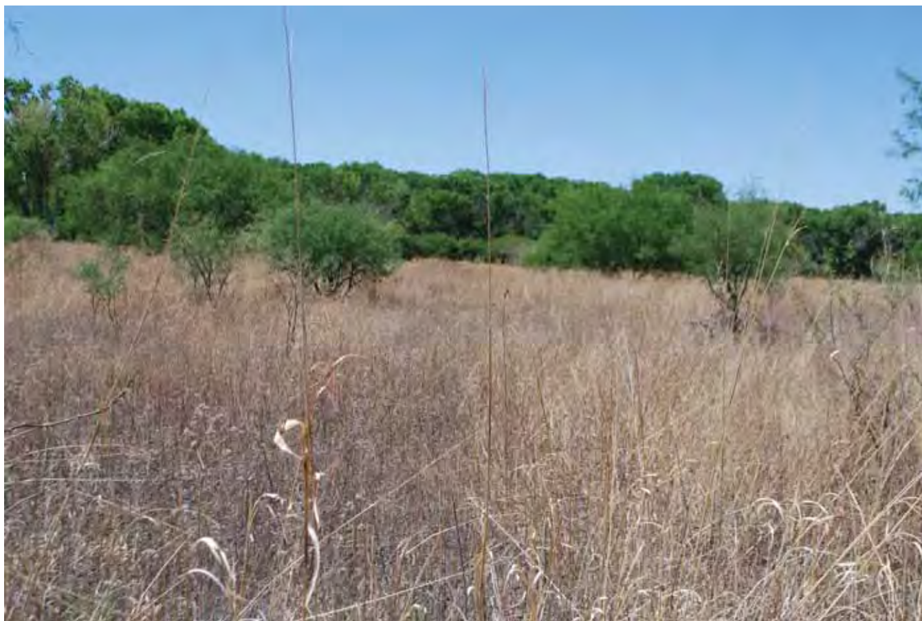
Fig. 9. Former masked bobwhite habitat across the Santa Cruz River from the Tubac, Arizona graveyard in June 2011—Elevation 983 m; July aspect. One suspects that bobwhite would survive in this area today if wild birds were introduced here.

“resident of grass plains, river valleys and foothills in the lower Sonoran zone.”