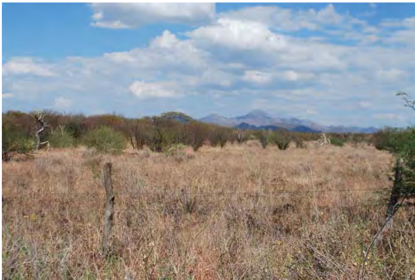
Fig. 2. Savanna vegetation on the volcanic mesa between Moctezuma and Tepache, Sonora at ~ 650 m elevation. Arid, and difficult to develop for water, such sites retain much of their original character and would be promising locales to look for bobwhites.