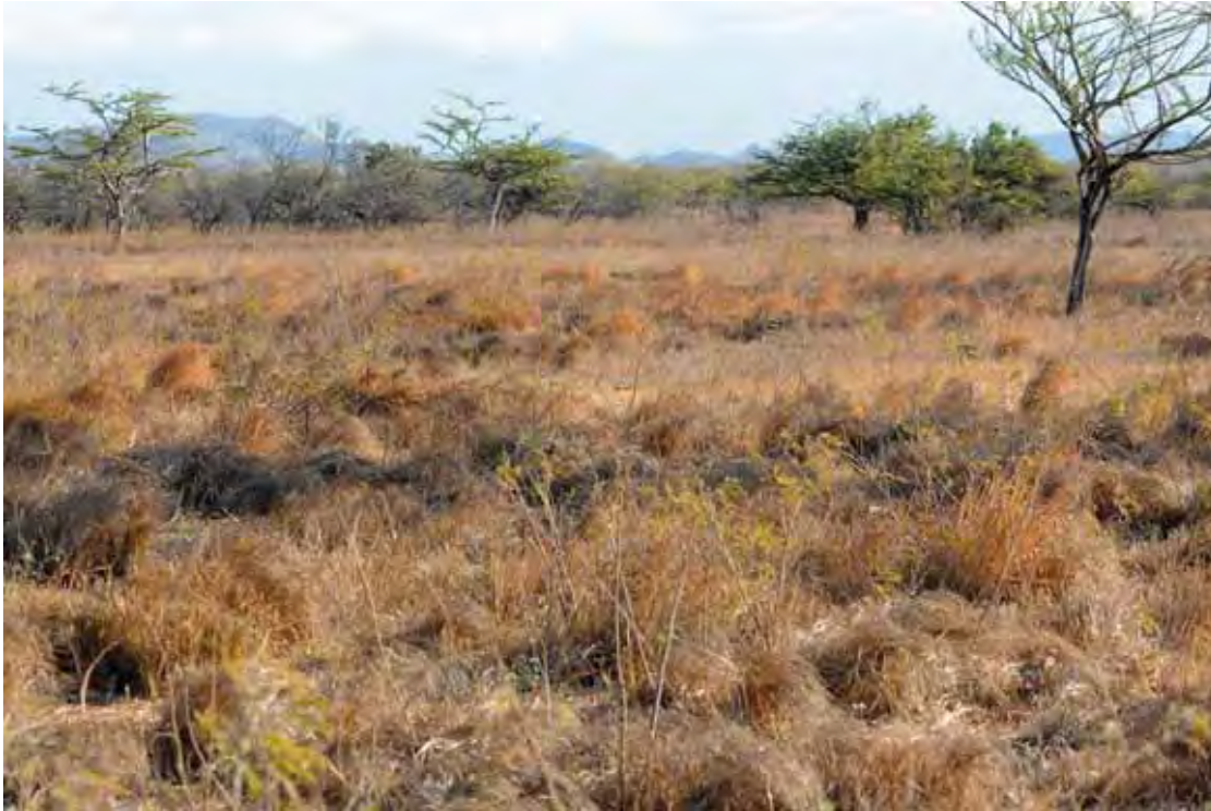
Fig. 7. Habitat of Colinus virginianus coylocos near the village of Montecillo Santa Cruz, Oaxaca. Note the savanna-like aspect of the vegetation with grasses and tropical deciduous trees, such as Crescentia alata . Two coveys of bobwhite were seen and photographed at this site in February 2011.