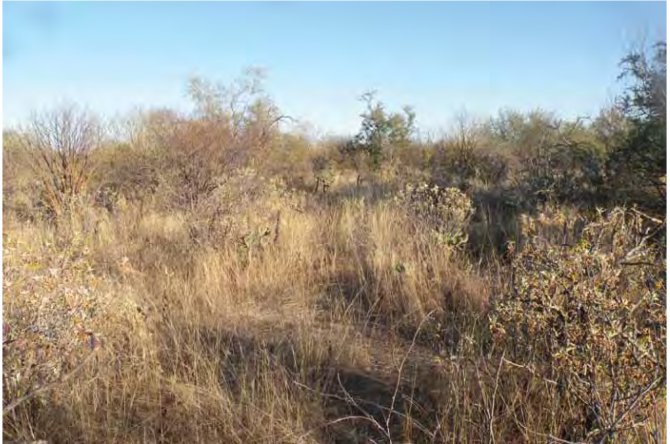
Fig. 13. Former savana being invaded by cholla and thornscrub on the Yaqui Indian Reservation near Agua Caliente Valley, Sonora. Although such sites appeared promising, the only quail located were elegant quail and Gambel's quail. This site appears to be a remnant savanna on sandy substrate.

conducted 20.76 km of foot surveys covering 159 ha of the best appearing habitat in an attempt to learn if masked bobwhite might still be present on the Yaqui Reservation. Six coveys of Gambel's quail ( Callipepla gambelii ) and 4 coveys of elegant quail were located but no bobwhite. Nor did any of the gallinaceous bird feathers obtained from verdin and cactus wren nests belong to masked bobwhite on comparing them with museum specimens of C. elegans . Evidence that we and the dogs were searching optimum habitats was indicated by incidental sightings of rufous-winged ( Peucaea carpalis ) and five-striped ( Amphispiza quinquestriata ) sparrows. One white-tailed hawk ( Buteo albicaudatus ) was observed over the Agua Caliente Valley on the first aerial reconnaissance.