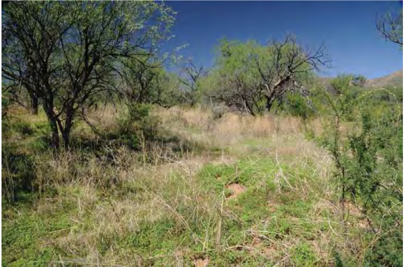
Fig. 4. Mesa southeast of Baboquivari Peak and northeast of old Sycamore Ranch thought to be the approximate site of the last masked bobwhite collected in Altar Valley. This photograph, taken in August 2011, shows a semi-desert grassland savanna at 1,060 m elevation, which is thought to be at the upper elevation range for this race of bobwhite.

more clearly drawn. In this respect they differ from the ridgwayi, which were found both in the valley and on the mesa.”