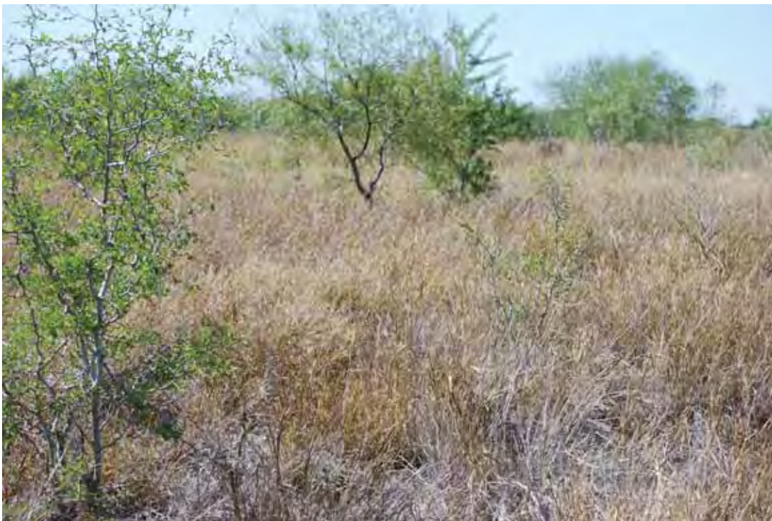
Fig. 8. Texas bobwhite savanna on Sal del Rey National Wildlife Refuge near Raymondville, Texas—October aspect. Three coveys of bobwhites were seen in the vicinity. The dominant understory grass is buffelgrass; the trees are Texas honey mesquite.