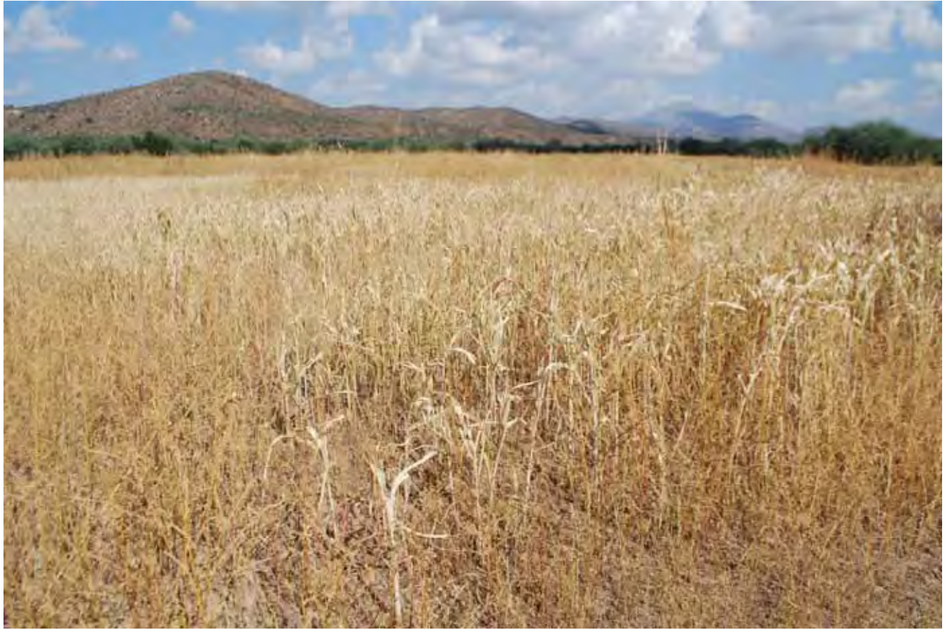
Fig. 11. Former masked bobwhite habitat 25.6 km north of Cumpas, Sonora, where Lt. H. C. Benson and J. C. Cahoon collected both masked bobwhite and elegant quail. The fallow fields at an elevation of 850 m had residual stalks of both barley and maize while grasses and forbs, especially Amaranthus palmeri , grow rank along the edges, which are bordered by velvet mesquites ( Prosopis velutina ).

near the town of Moctezuma. Here, numerous pastures with dense Amaranthus (1.2 to 1.8 m tall) occur adjacent to grassy fields and wooded riversides. We can only speculate that pasturing of livestock in these areas during droughts, possibly combined with subsistence trapping of quail, led to the disappearance of masked bobwhite from these areas.