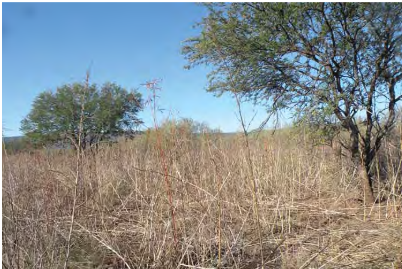
Fig. 14. A weedy bajío in the Valle del Agua Caliente—another former favorite masked bobwhite haunt now heavily impacted by livestock, in this case horses. Not finding any sign of bobwhite here despite a 4-hr search was a major disappointment.