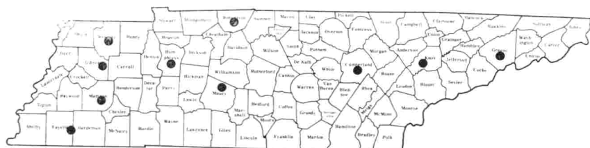
Locations of field crop variety tests in Tennessee, 1977.