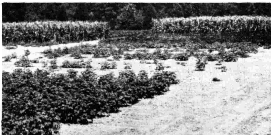
Figure 4. In 1975, no till plots (center) failed because of poor seedling emergence.

In a combined analysis for 1974 and 1975, plant counts were significantly higher ( p < 0.01 ) in 1974 than in 1975. The effect of tillage method on seedling emergence was significant ( p < 0.05 ) with no till plots having the poorest emergence, although they were highest in 1974.