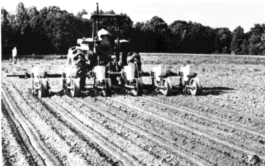
Figure 1. Six-row planter mounted on a rigid tool bar and used on conventional and bedded plots in 1974 and 1975.

and July 27. High traffic, 2-row plots were trafficked with a high-clearance sprayer a total of six times during July and August. In addition, the 2-row, low traffic and the 4-row plots on Collins were trafficked by the high-clearance sprayer two times during the season. A defoliant was applied to all plots with the same sprayer. The plots were picked with a one-row picker and stalks were cut with a 2-row rotary mower. The number of trips each row received is given in Table 2.