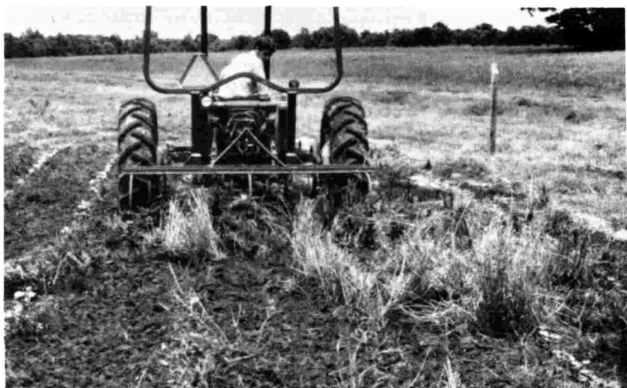
Figure 3. Killed sod and grass collected on cultivator sweeps during first cultivation of no till plots in 1974.