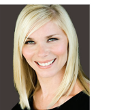
Comedian: Leanne Morgan