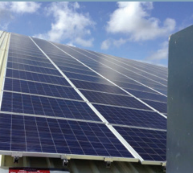
Puerto Princesa 78 kw Solar Rooftop