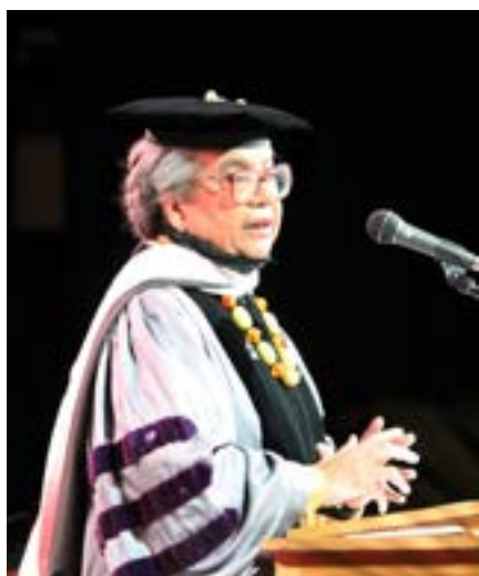
Marian Wright Edelman