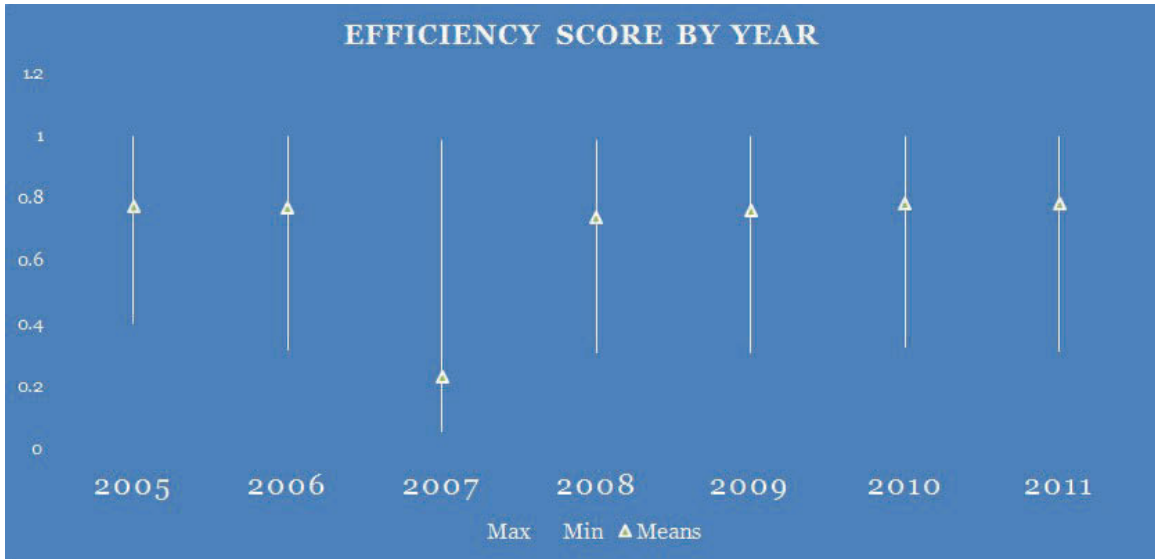
Figure 4.1: Efficiency Scores Drop in 2007

The first set of DEA results focus on analyzing the efficiency of hospitals that won quality awards during the period from 2005 to 2009. Table 4.3 shows efficiency scores for award-winning hospitals and the trend in their efficiency scores several years after winning a quality award. It can be noted that on the base year, when the quality award is given, award-winning hospitals exhibit lower than average efficiency. The standard deviation of award winning hospitals' efficiency scores are much larger than the average, which means some award winning hospitals have extreme low efficiency scores. The situation remains unchanged even one year after winning a quality award. However, two years after winning a quality award, award-winning hospitals display a leap in their performance, as indicated by their increased average efficiency score. Within three years after winning a quality award, award-winning hospitals improve their efficiency even further and achieve significant higher scores than their counterparts which do not win a quality award. The trend is also shown in Figure 4.2. This difference has been confirmed as statistically significant in both t-tests for the equality of means and Wilcoxon rank-sum tests for the equality of medians.