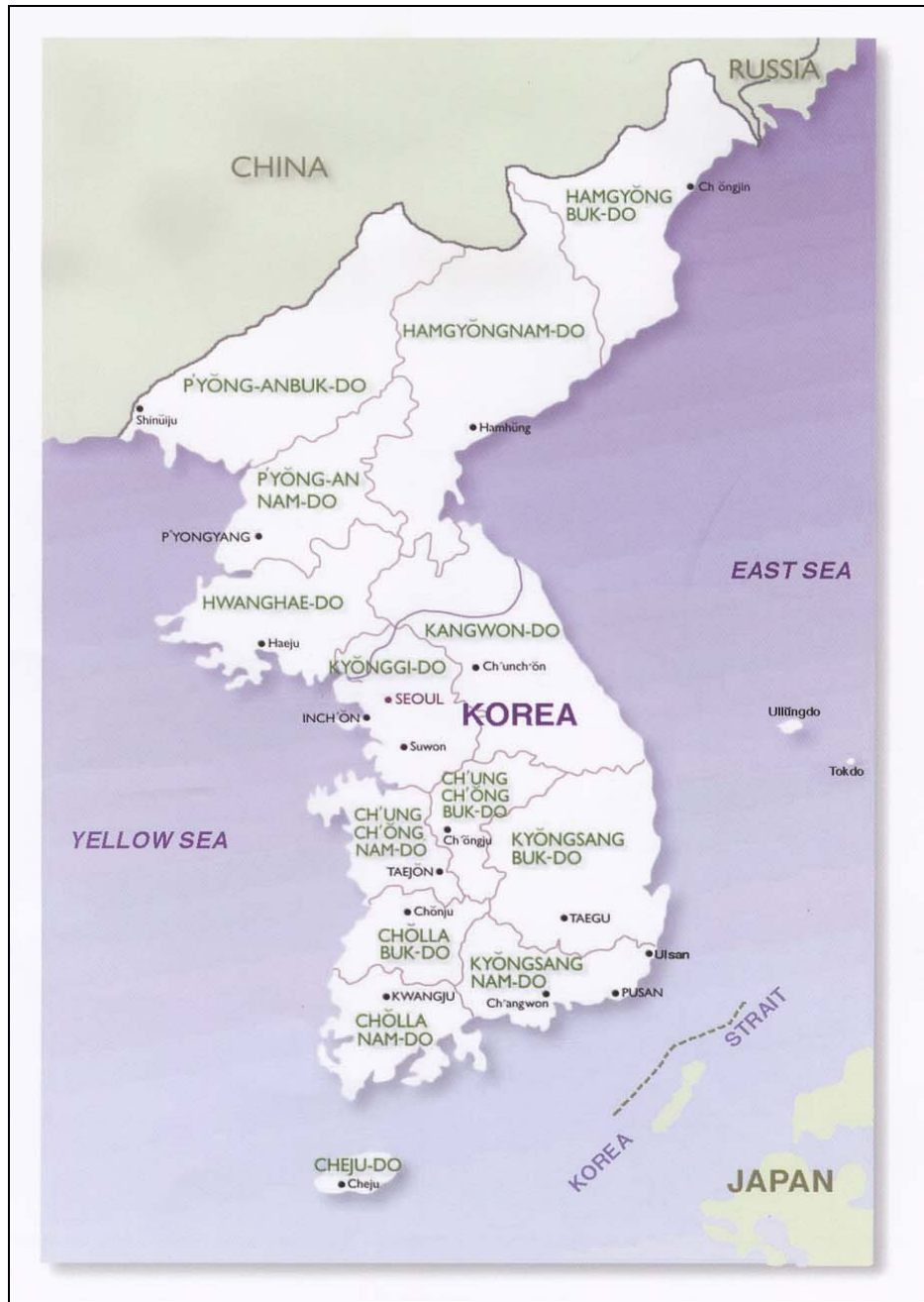
Figure 1: Major Cities and Provinces in Korean Peninsula