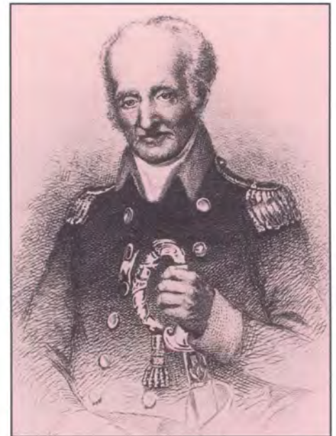
Return J. Meigs as depicted in an engraving in the Library of Congress. (Malone, Henry Thompson, Cherokees of the Old South: A People in Transition, Athens: University of Georgia Press, 1956, fourth of eight unnumbered pages between pp. 82-83.)