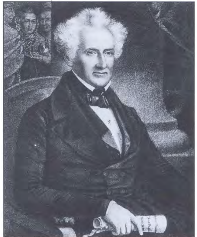
Thomas L. McKenney, one of the most significant yet least known figures in the history of the American Indian. He was known as "White Eagle" in Indian circles. (McKenney, Thomas L., Memoirs, Official and Personal , New York: Paine and Burgess, 1846, frontispiece.)

Of course changes, mostly subtle, did occur due to the medium of each portrait. However, warmth and texture are not important here. It is the "perfect likenesses" captured in these reproduced portraits of the Indians that provide a di-