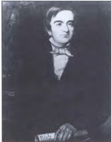
John Ross circa 1848 from a painting owned by the Oklahoma Historical Society. (Moulton, Gary E. John Ross Cherokee Chief, Athens: The University of Georgia Press, 1978, frontis.)