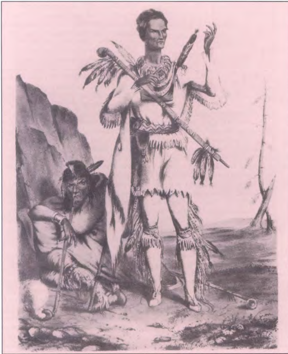
A spirited likeness of the celebrated chief, Red Bird, standing, and his crony, We-kau. "Of all the Indians I ever saw, he is, without exception, the most perfect in form, in face, and gesture," wrote Thomas McKenney. (McKenney, Thomas L. and Hall, James, History of the Indian Tribes of North America, with Biographical Sketches and Anecdotes of the Principal Chiefs , Philadelphia: D. Rice & A.N. Hart, 1855, Vol. II, frontispiece.)

Watching these receptions and trusting his intuition the tribes would vanish along with their culture, McKenney began thinking about posterity. He writes in a letter to a friend in Baltimore of "being ready with the answer to the question which it is fair to presume will be asked: 'What sort of a being was the red man of America?'"