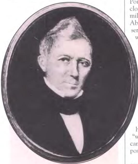
Wilson Lumpkin, former Governor of Georgia, not only led Georgia's removal efforts, he defended his actions in a two volume history. (Lumpkin, Wilson, The Removal of the Cherokee Indians from Georgia, New York: Dodd, Mead & Co., 1907, Vol. II, frontis.)