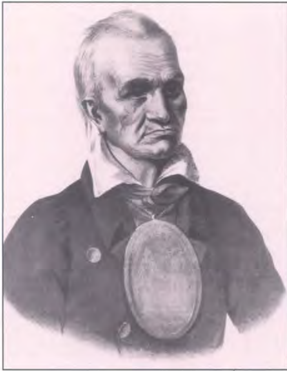
Red Jacket, a stern Seneca chief noted for his leadership among all North American Tribes.

many subordinate clauses adorn a single sentence, each sentence is still disciplined, controlled in structure, and clear in meaning.