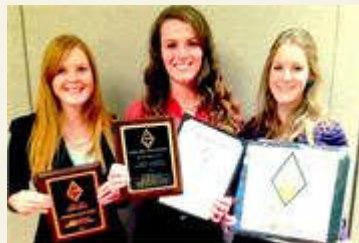
At their society's annual