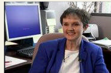
The Southern Region of