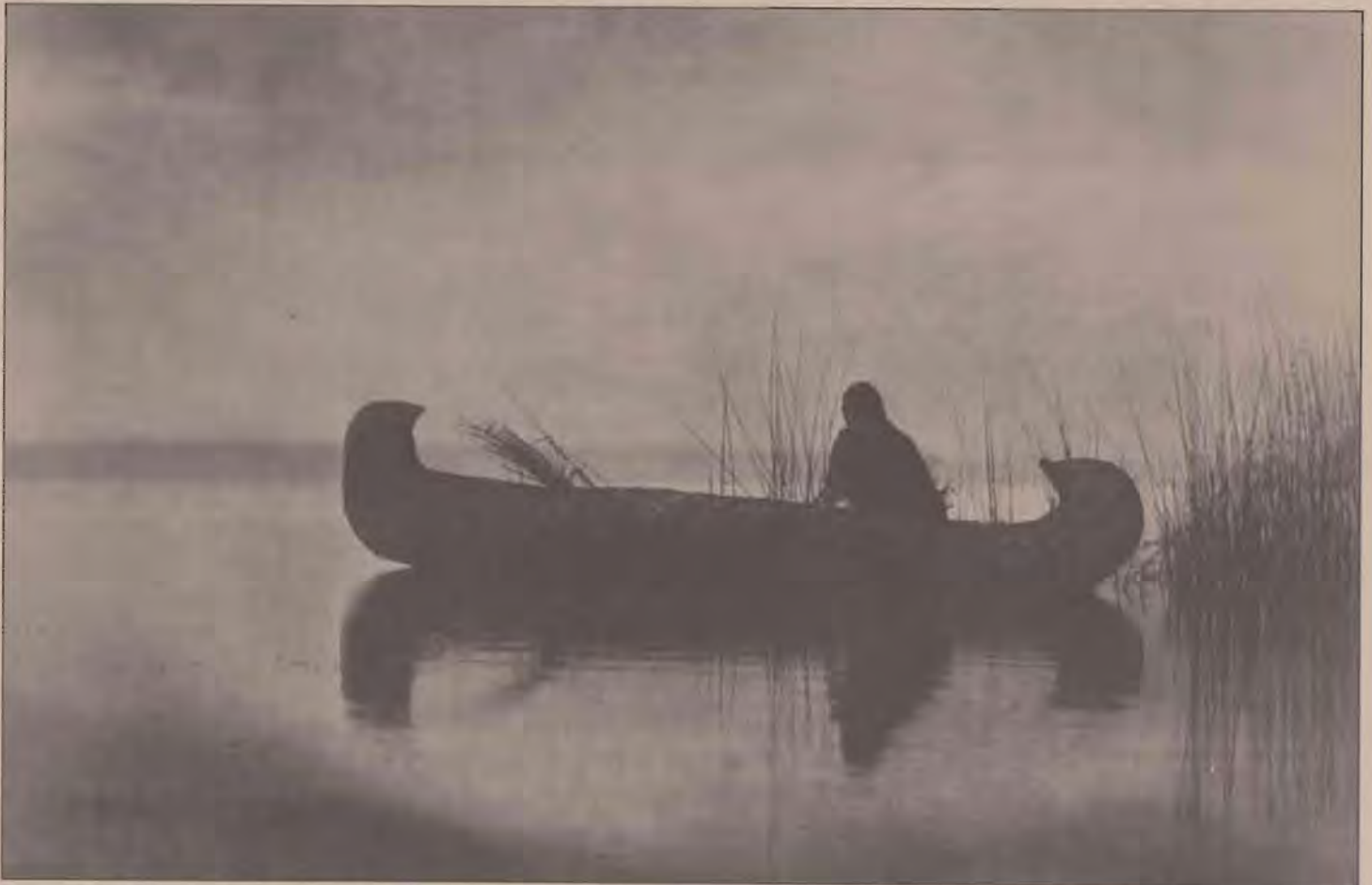
"Kutenai Duck Hunter."

We had a packing list, of course, but I thought it would be easier to just