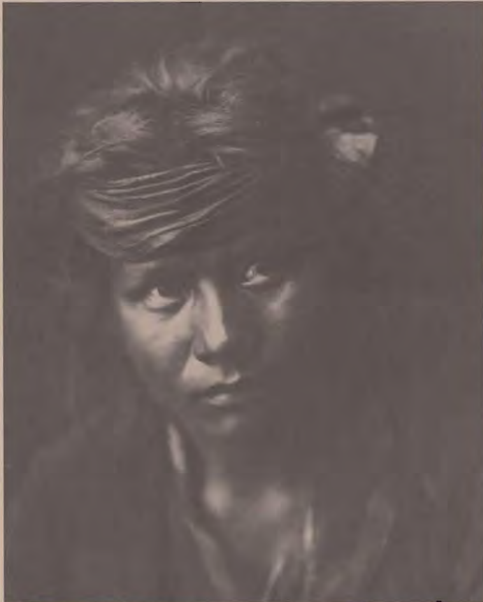
"Son of the Desert—Navaho." (Curtis, Edwin S., The North American Indian , Vol. 1, Cambridge: by the Author, 1907, Plate 32.)