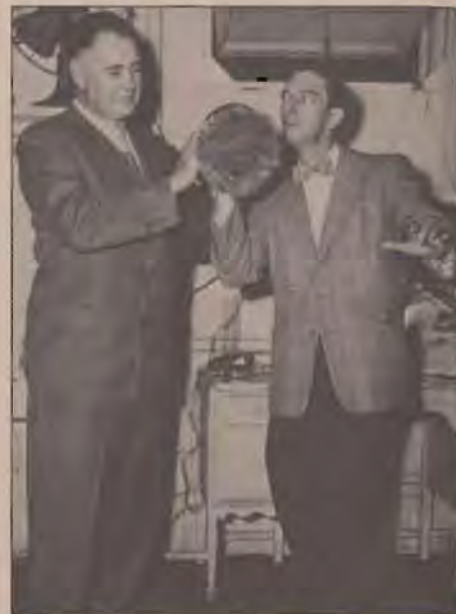
General Neyland instructs Ray Bolger in the fine art of passing.