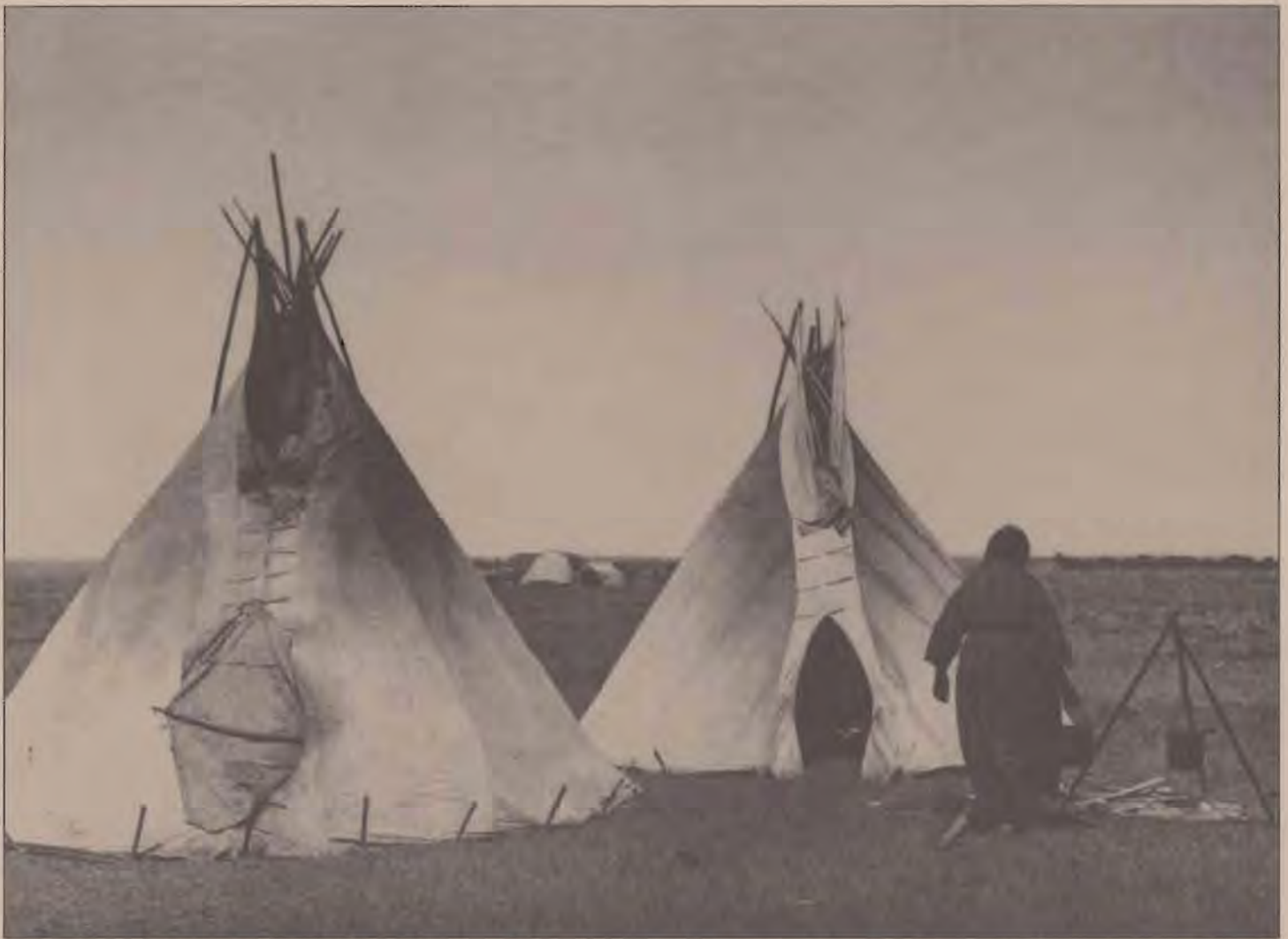
"A Prairie Camp." (Curtis, Edwin S., The North American Indian , Vol. 3, Cambridge: by the Author, 1908, facing p. 72.)

caused it to be overlooked until fairly recently. It was available on Holland Van Gelder paper, Japan vellum, and Japanese tissue, with tissue being the most expensive and also the scarcest, amounting to no more than twenty-five to thirty sets. In 1935 the Morgan Library liquidated the assets of The North American Indian Corporation by selling the nineteen remaining complete sets, all plates and existing prints, and the copyright to the Charles Lauriat Company for one thousand dollars and future royalties. Lauriat sold the nineteen sets and assembled fifty more, bringing the total produced to two hundred ninety-one. The original glass negatives were never shipped. They remained in the basement of the Morgan Library and during World War II were finally either dispersed or destroyed.