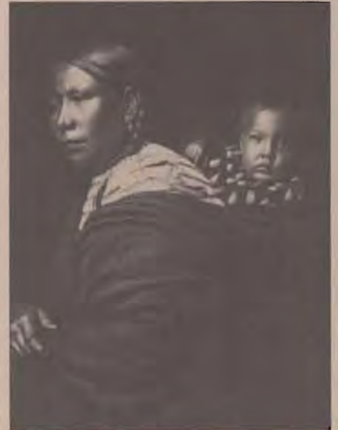
"Mother and Child." (Curtis, Edwin S., The North American Indian , Vol. 3, Cambridge: by the Author, 1908, facing p. 18.)