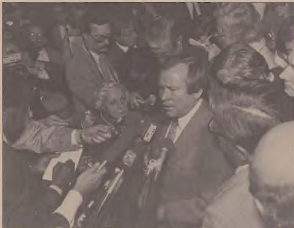
Senator Howard H. Baker, Jr. with the press after being elected Senate Majority Leader, December 5, 1980.

The processing of the collection began late last fall (1991) and is expected to be completed in the fall of 1993. In general, the processing involves identifying, arranging, and describing the contents of the several hundred boxes of records and preparing them for archival storage. As part of the processing, the records are analyzed for long term preservation needs. When possible, materials that hasten deterioration or damage the records, such as metal paper clips and binders, vinyl notebooks, plastic enclosures, rubber bands, etc., are removed. Some documents are treated for mold and water damage, flattened, unfolded, encapsulated, and/or photocopied as nec-