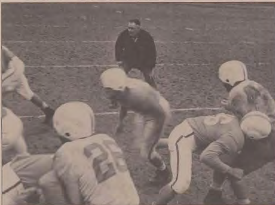
General Neyland at work.