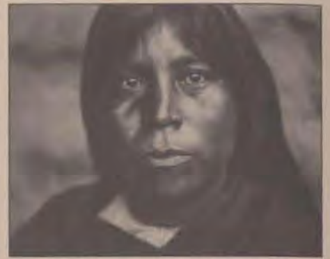
"Qahatika Matron."