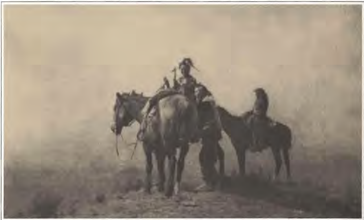
"Scouts." (Curtis, Edwin S., The North American Indian , Vol. 3, Cambridge: by the Author, 1908, facing p. 42.)

The 1991-92 year can be characterized as a year of budget retrenchment, which placed an even greater importance on private support than in the past.