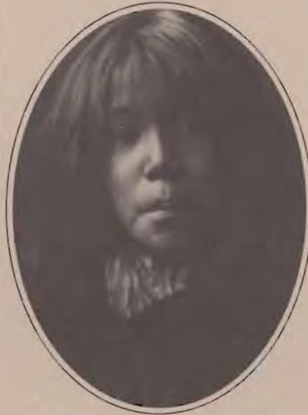
"Mohave Child." (Curtis, Edwin S., The North American Indian , Vol. 2, Cambridge: by the Author, 1908, facing p. 46.)