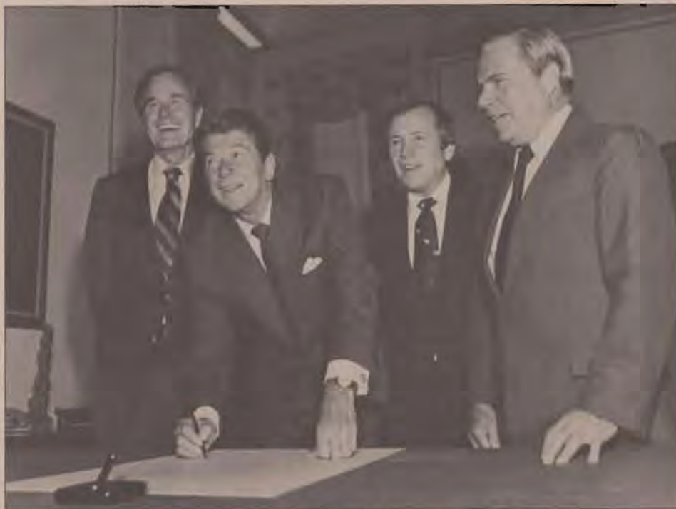
Republican vice presidential candidate George Bush and presidential candidate Ronald Reagan with Senator Howard Baker, Jr. and Congressman John J. Rhodes (Arizona) at the Republican Unity Day Signing Ceremony of GOP proposals, September 15, 1980.

essary for their preservation. Papers are transferred into acid free folders, and all materials are put in acid free archival storage boxes and housed in a secured, humidity and temperature controlled environment. When the collection opens to the public in 1997, a written guide will be available to patrons which will include a description of the collection in general and its overall arrangement, a description of the contents and organiza-