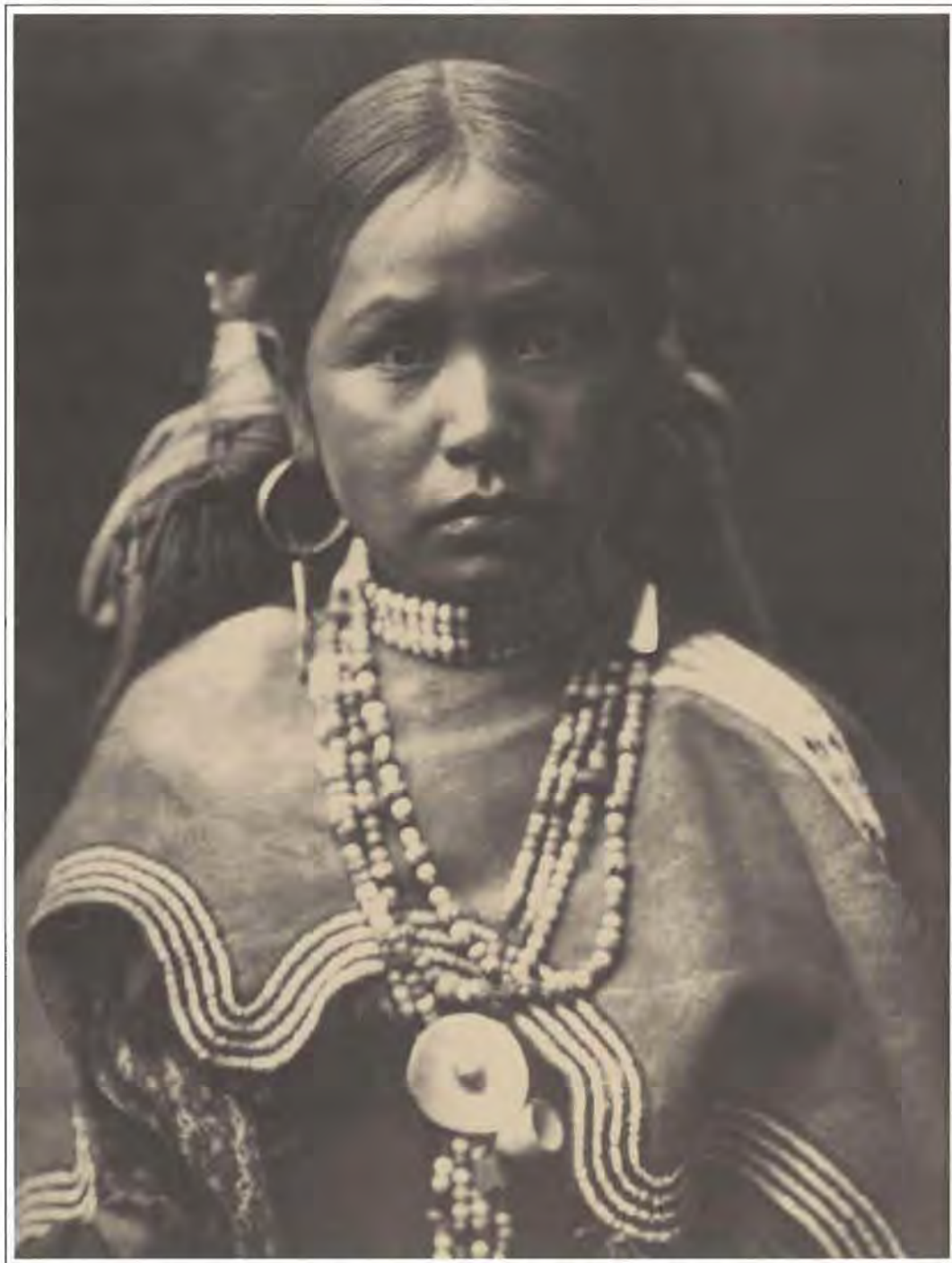
"Jicarilla Maiden." (Curtis, Edwin S., The North American Indian , Vol. 1, Cambridge: by the Author, 1907, Plate 22.)

Back Cover: "Pikehodiklad—Navaho" from The North American Indian, Vol. 1, Cambridge: by the Author, facing p. 118. Navaho dry painting was done by hand with colored sand. Many, like this one used on the fifth night of the nine day Night Chant, were quite large and required the help of numerous individuals. The ceremony had to do with healing, and this night's activities were designed to frighten the patient, who sat at the waist-line of the central figure. Thus the meaning of the name, "Frighten him on it."