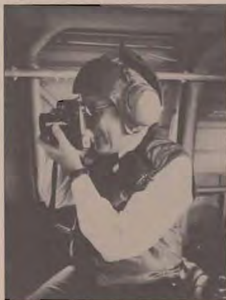
Senator Howard H. Baker, Jr. enjoying his favorite hobby (photography) while on a trip to Europe, August 1980.

essary for their preservation. Papers are transferred into acid free folders, and all materials are put in acid free archival storage boxes and housed in a secured, humidity and temperature controlled environment. When the collection opens to the public in 1997, a written guide will be available to patrons which will include a description of the collection in general and its overall arrangement, a description of the contents and organiza-