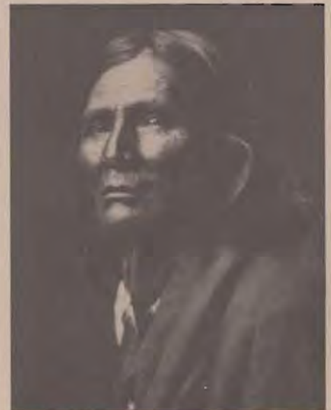
"Alchise—Apache." (Curtis, Edwin S., The North American Indian , Vol. 1, Cambridge: by the Author, 1907, facing p. 10.)