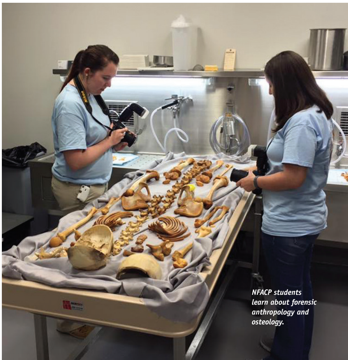
NFACP students learn about forensic anthropology and osteology.