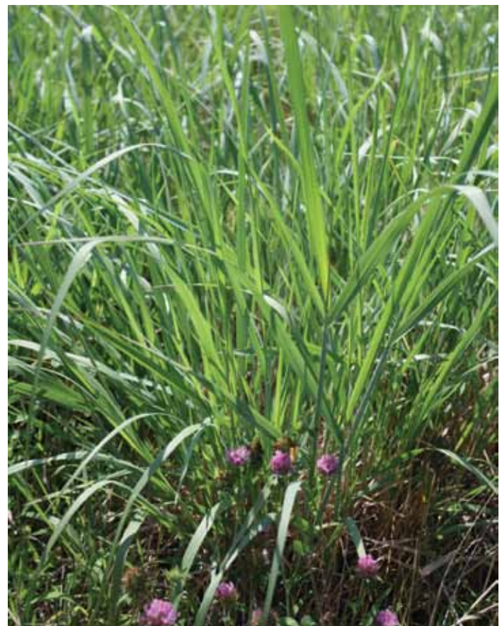
Figure 4. Red clover flowering in a switchgrass pasture

with respect to establishment and persistence during trials at the University of Tennessee.