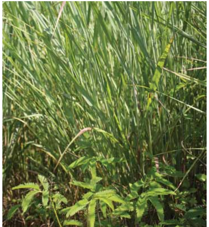
Figure 7. Partridge pea growing in a switchgrass canopy

Partridge pea is a native, reseeding annual that is tolerant to low soil fertility and complements switchgrass well (Figure 7). Partridge pea should be planted in February to March, and it grows during the summer months. Our research indicates that the annual average nitrogen replacement value of partridge pea is 60 lbs per acre. However, as cattle forage, there may be limitations relating to palatability because seeds can cause irritation in the digestive tract if consumed in large quantities. As such, its primary value may be in biofuel production.