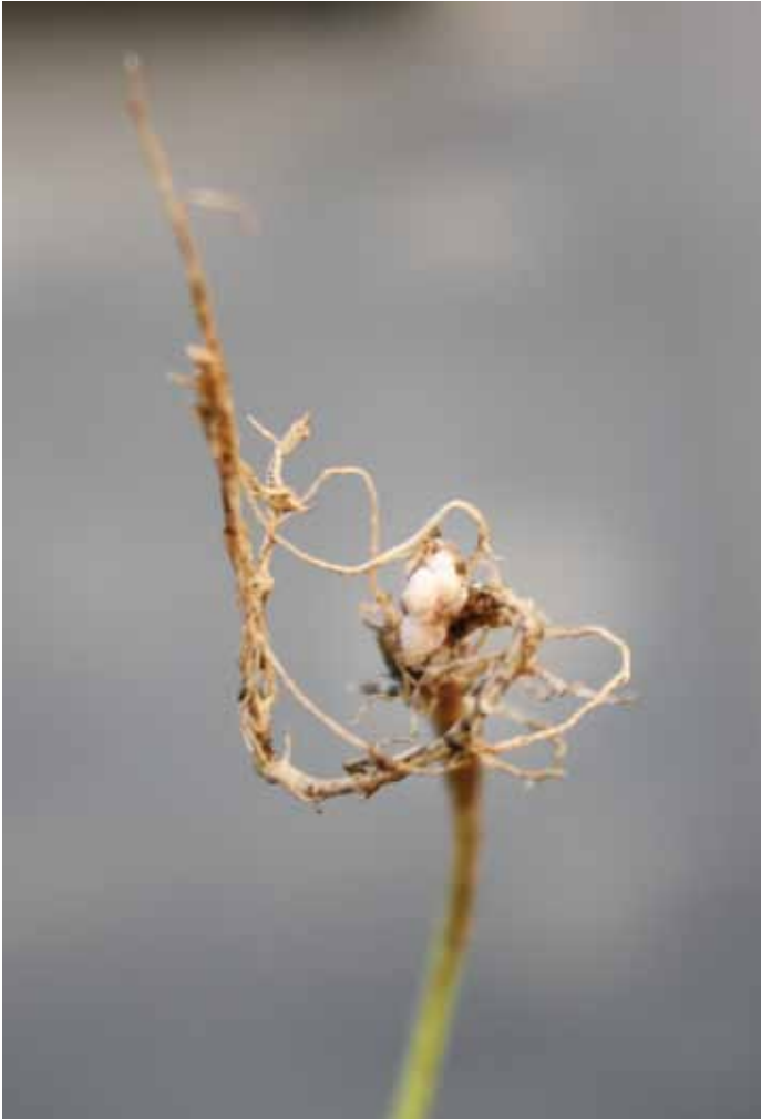
Figure 9. Nodules on legume roots (pink color indicates leghaemoglobin, an iron containing protein that converts nitrogen gas to a plant-usable form [ammonia])

Seeds that come preinoculated have a stronger sticker and are often rolled in limestone or rock phosphate, which combats unfavorable conditions, such as low pH and temperature extremes, and can be stored for longer periods. Lastly, do not inoculate seed directly in the planter box, because inoculant and seed tend to separate when dry, leading to uneven seed coverage.