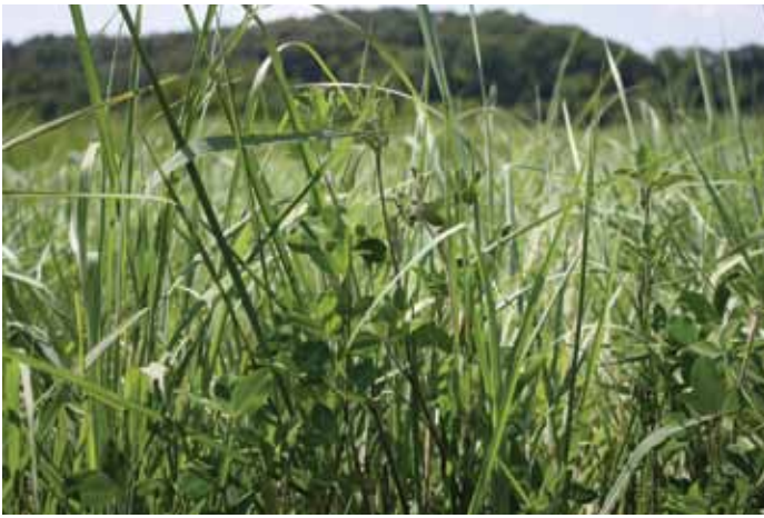
Figure 2. Switchgrass and clover growing together before a forage harvest in Tennessee

Although legumes have been used in cool-season pastures and hayfields, they are not widely used in NWSG production. However, given the trends in the price of nitrogen fertilizers in recent years, interseeding legumes could become an important management practice. Guidelines for NWSG forage production call for 60-90 lbs N per acre annually after the establishment year. However, even under optimal management, plants usually take up only 40-60 percent of applied fertilizer, meaning about half of the fertilizer applied is not used and is generally lost to groundwater or volatilization. Replacing nitrogen fertilizers with legumes in hay or grazing systems can be more efficient and cost-effective. Legumes also can increase soil-organic carbon and phosphorus and suppress weed growth by competing for water and nutrients. Lastly, research from our studies has shown that switchgrass forage yields can be as much as 20 percent higher when legumes are planted as an intercrop.