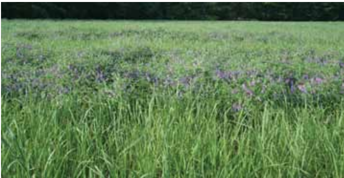
Figure 8. Hairy vetch growing in a switchgrass field

Hairy and common vetches are legumes that occur naturally throughout the South and are frequently found growing on roadsides and in fields and pastures (Figure 8). They are well-adapted to moderately to well-drained soils. These vetches reseed readily for many years and will colonize low-fertility soils. No seedbed preparation is needed, and seed is usually no-till drilled 1/2 to 3/4 inch deep. Common vetch has less hard seed than hairy vetch, making it less of a potential weed problem, but it may require seed scarification. In a seed dormancy study, we determined that common vetch hard seed can be reduced by mechanically scarifying the seed coat, but such measures can be time-consuming. In addition, common vetch matures 10-14 days earlier than hairy, lessening competition with NWSG. Our research has measured fixation rates of 53 to 67 lbs N per acre for both vetches; thus, the addition of N fertilizer for grass growth is not necessary. Hairy vetch makes high-quality hay. However, because of its climbing growth habit, it may compete with and weaken NWSG stands and invade nearby fields. This can be mitigated through appropriate seeding rates (Table 1) and timely spring grazing. In some cases, mowing may be needed to manage excessive vetch competition.