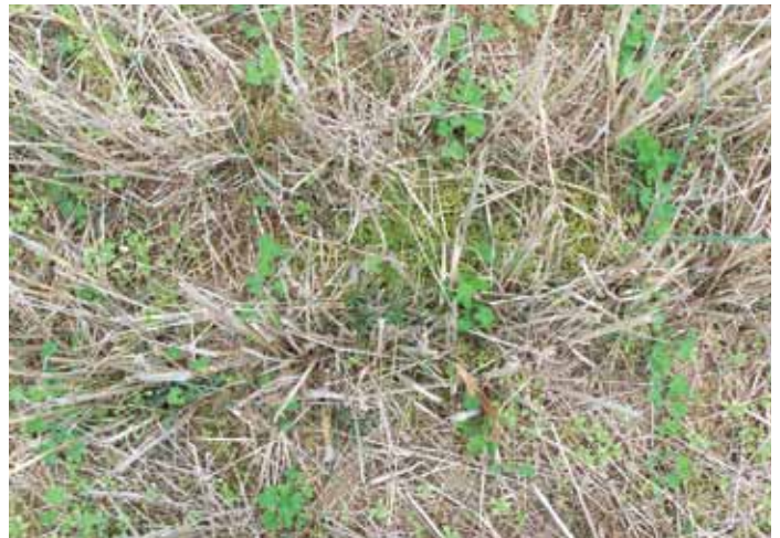
Figure 6. Clover seeded into NWSG stubble during grass dormancy

Crimson clover flowers earlier in spring than other clovers and produces high yields even in cool winters but has a shorter grazing season, maturing in late April. Crimson clover can be planted with a drill, a cultipacker-seeder, or can be broadcast from late August to October (Figure 6). Crimson clover grows well in both sandy and clay soils that are well-drained and performs better than most other clovers on poor sites. Seeding depth should be 1/4 inch. In a reseeding experiment conducted at the University of Tennessee, crimson clover and red clover had the highest densities after annual reseeding. However, crimson clover stands that are well-established in the fall can be too competitive with NWSG in the spring; therefore, it is important to plant at a reduced seeding rate (for specific rates, see Table 1).