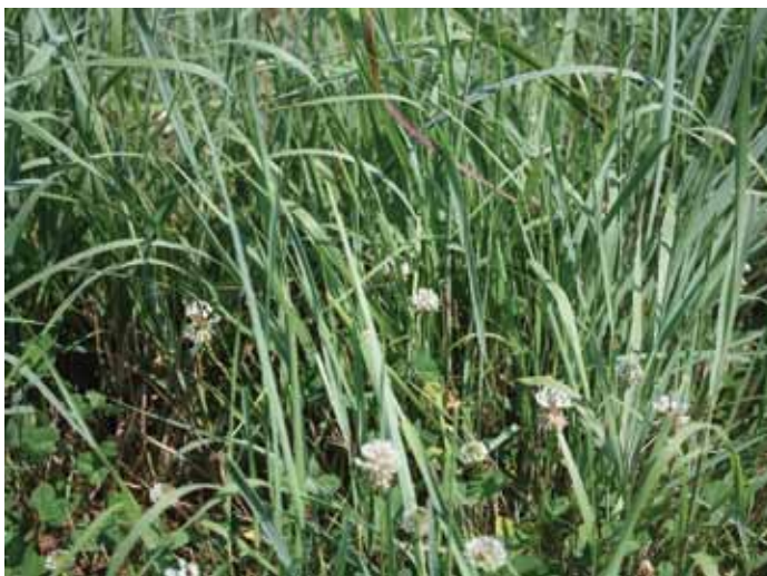
Figure 5. White clover growing in tandem with switchgrass at a proper density

White (or ladino) clover is a cool-season legume that grows well over a variety of soils and climates; however, it prefers cool and wet conditions. White clover will grow in soils considered too acidic for red clover (Figure 5) and alfalfa. This long-lived legume can be seeded February through April or August through September to a depth of 1/4 inch. The two greatest concerns when using white clover is its inability to survive extended dry periods and the potential for it to cause bloat in grazing livestock; however, any clover has the potential to cause bloat if it is not mixed in a grass stand where availability is reduced. In studies underway, switchgrass interseeded with white clover yielded equivalent hay compared to 30 and 60 lbs N per acre.