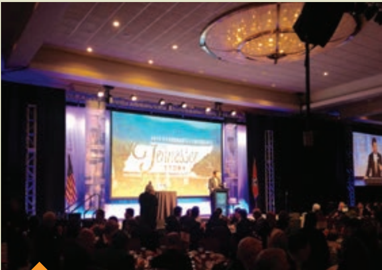
The UT Center for Industrial Services hosted a booth at the 2014 Governor’s Conference for Economic Development held in November. The theme of the conference was The Tennessee Story and focused on the economic successes of state organizations.

These are only a few examples of IPS intern success stories. The need for knowledgeable and skilled people to enter into careers in local government continues to grow, and the University of Tennessee continues to help meet that need through its Institute for Public Service Internship Program. ✕