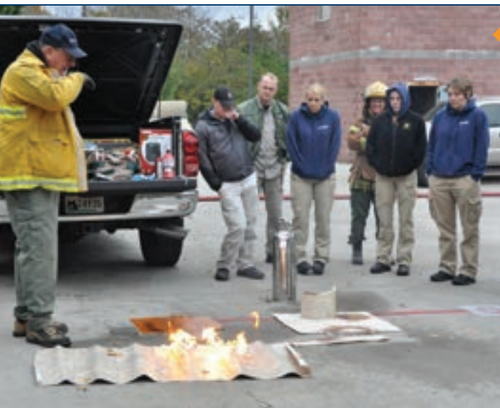
Scenes from the National Forensic Academy Session XXXVII.