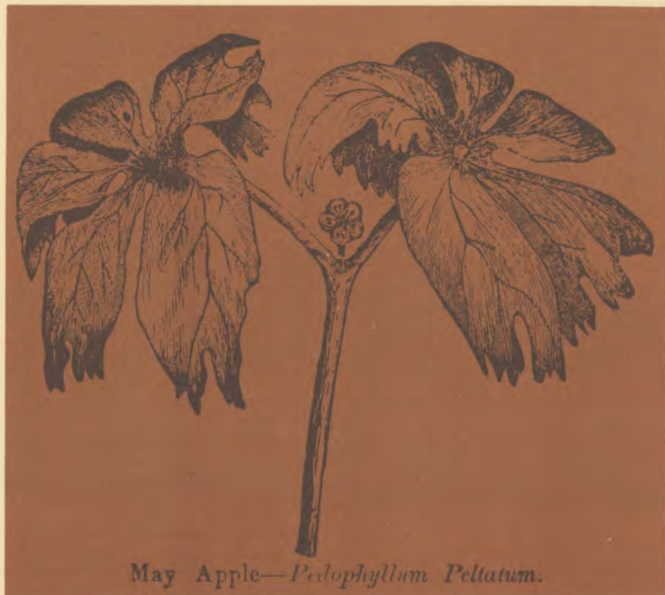
May Apple— Podophyllum Peltatum .

The Table of Post Offices in the United States is a desirable acquisition not only because it once belonged to Andrew Jackson, but because it is in itself a rare and useful book. Before the days of the Government Printing Office, such publications as the post office guide were not routinely issued. It is suspected that only a few copies of the 1831 guide can now be located. Without the assistance of library friends like the Koellas, it would not be possible to obtain such outstanding and unusual materials. The University is fortunate to count the Koellas among its supportive alumni. ■