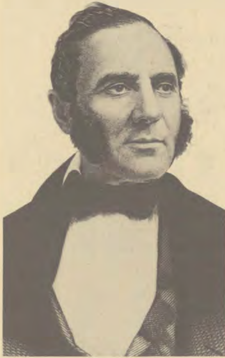
T. A. Gunn M.D.

sought after issue of Gunn is the eighth edition, which was published at Pumpkintown in 1839. It followed the seventh edition produced in Madisonville in 1837. Pumpkintown was a village in Monroe County near Madisonville that is virtually unknown today. The Pumpkintown imprint is recorded as being in only six libraries. UT, due to the munificence of its supporters, is pleased to be one of the repositories owning a Pumpkintown Gunn. This edition was acquired a few months ago through the interest of a longtime contributor.