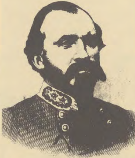
John Hunt Morgan