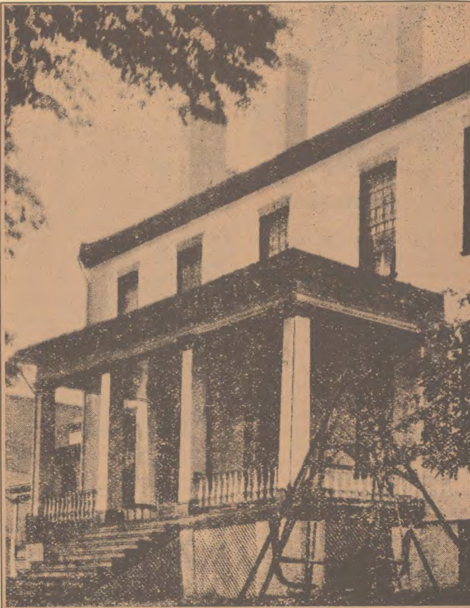
Williams house, Greeneville, Tennessee, where General Morgan was killed. From Bromfield Ridley's Battles and Sketches of the Army of Tennessee (Mexico, Mo., 1906).