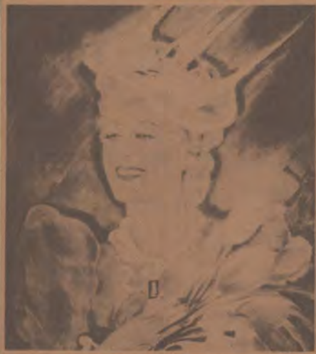
ROWENA RUTHERFORD FARRAR