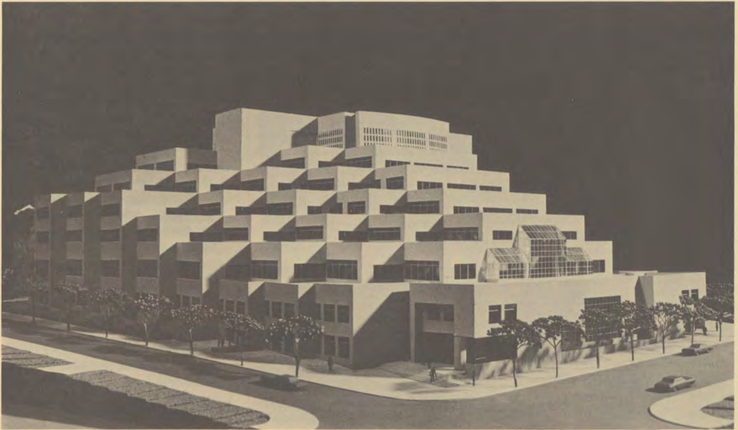
Proposed expansion of the Undergraduate Library.