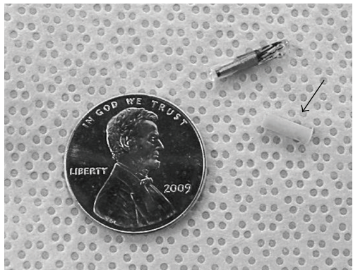
FIGURE 1: The terbinafine impregnated implant (arrow) is shown next to a PIT tag (microchip) and penny.

in other refractory mycotic infections in humans [15]. Geomyces destructans has been shown to be susceptible to other antifungal agents in vitro including fluconazole, but terbinafine has a better safety profile than many other commonly used antifungal medications [16–18].