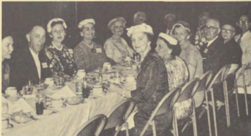
Class of 1919 at their 40th Class Reunion, June, 1959.

Much of the credit for creating and making a success of this fund must go to several members of the class. At the 35th reunion