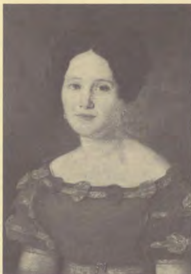
RACHEL JACKSON — CIRCA 1820