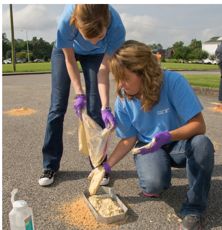
Students learn how to cast shoeprints with dental stone.

The students spent half of their classes (continued on page 2)