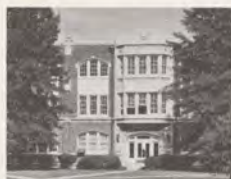
Memphis Medical Center 72,062 Volumes

U-T Space Institute, Tullahoma 2,478 Volumes