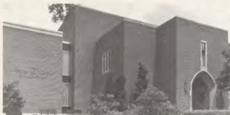
James D. Hoskins Library, Knoxville 576,042 Volumes