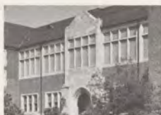
Law 73,717 Volumes