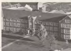
Agriculture 47,973 Volumes,