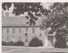
U-T at Martin 52,813 Volumes