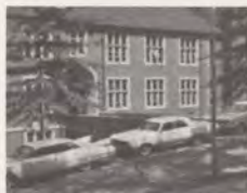
Science 42,040 Volumes