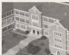
Business Administration 16,386 Volumes