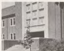
Education 27,119 Volumes

Extension Centers-Knoxville, Nashville, and Memphis 22,285 Volumes