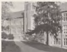
Engineering 25,193 Volumes