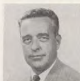
Paul C. Sherbakoff University Center