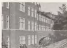
Biology 20,752 Volumes