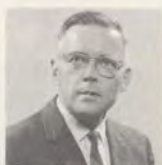
Homer F. Johnson, Jr., Engineering