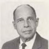
Arthur B. Wood Engineering