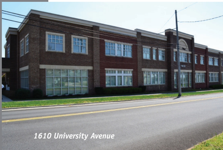
1610 University Avenue

THE UNIVERSITY OF TENNESSEE SYSTEM'S Knoxville footprint is growing to include the Mechanicsville area with the relocation of the UT Institute for Public Service (IPS). The institute's offices, and its 65 employees, will move into a building, previously occupied by state of Tennessee employees, at 1610 University Ave. IPS's administration offices - based in the Communications and (Student Services) University Extension Building on the Knoxville campus - as well as regional employees from two of its agencies, the Center for Industrial Services and the County Technical Assistance Service began occupying the building Thanksgiving week. The