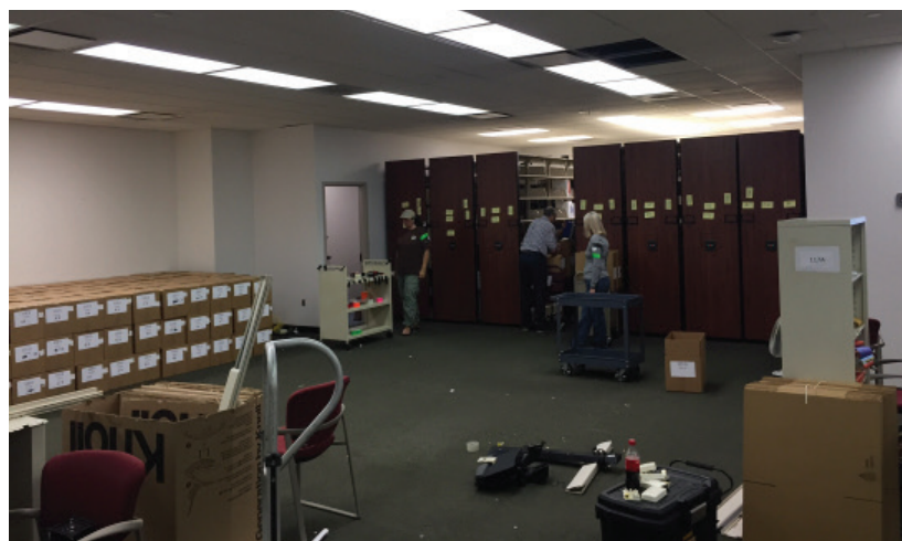
Tear down of library area and shelves.

UT purchased two buildings from Knoxville's Community Development Corp. in May 2014. The 1610 University Ave. building is a two-story, 29,000 square foot office building. The UT Foundation will be relocating to the second building at 1525 University Ave. The foundation's new home is 15,800 square feet with two floors. A timeline for the renovation at 1525 is not set. When the Foundation relocates, that will bring the employee total in the two buildings to 120.