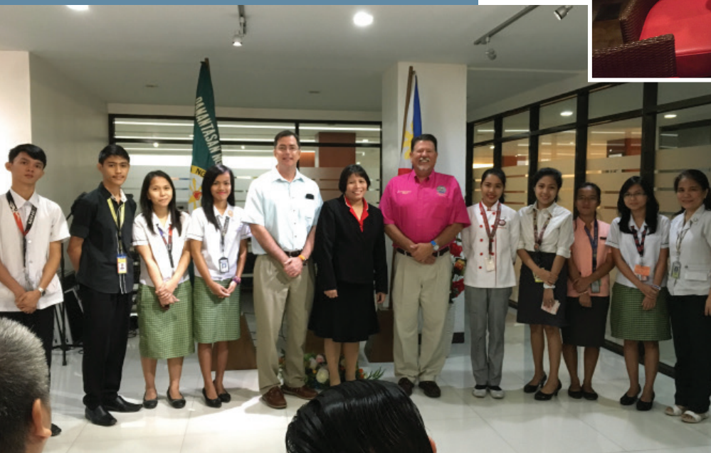
Pasig City University scholarship ceremony

TREEDC concluded its visit by confirming its list of Philippine visitors to the 2nd Annual international Renewable Energy Conference set for December 14-15, 2015 at Tennessee Tech University.