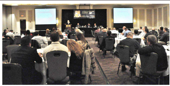
Participants attend the Best Practices Symposium hosted by the UT Law Enforcement Innovation Center (LEIC) in Nashville.