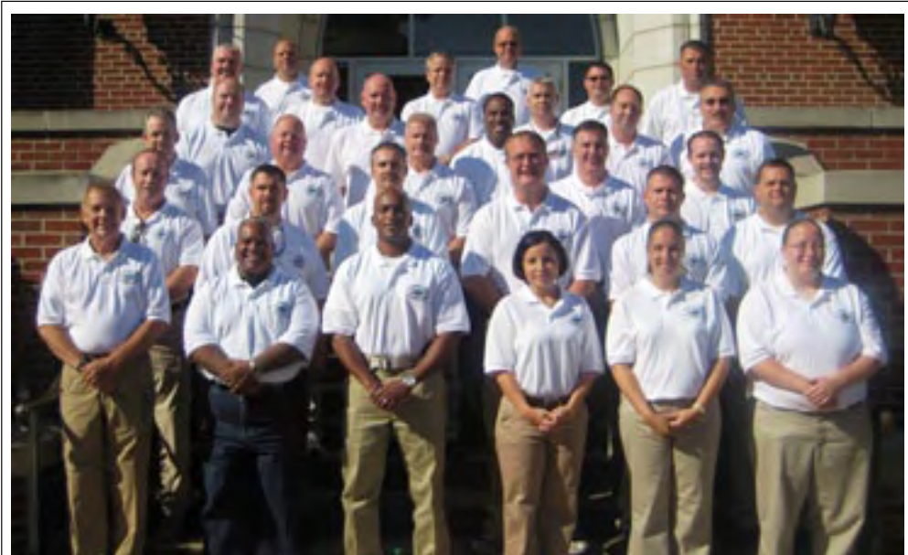
SECLA: Session 12 Class Participants

The program offers undergraduate and graduate credit hours through UTC. The students can also transfer the credit hours to another university or college and apply them toward a degree in criminal justice. This session will be complete on March 8, 2013, bringing the total number of SECLA grads to 301.