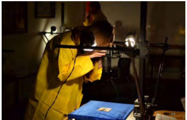
A student uses the photo stand to document fingerprints on a floppy disk.