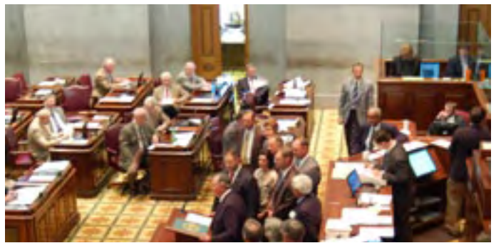
The Leadership Academy class attended the opening night session of the House of Representatives.