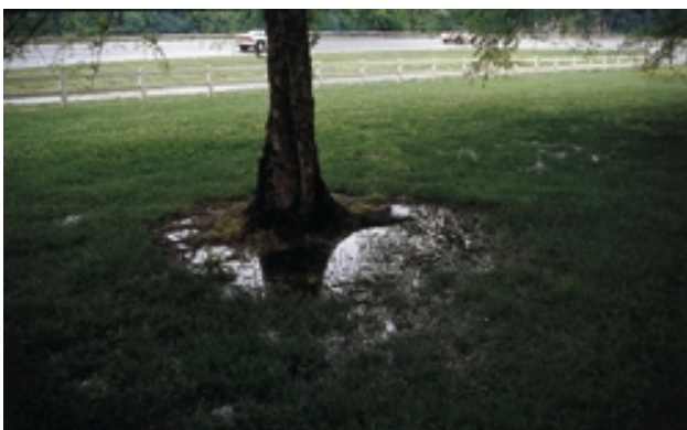
Wayne K. Clatterbuck

Poor drainage often occurs when contractors remove topsoil during construction of new homes, leaving only subsoil. The amount of topsoil reapplied may be unknown. A plant sitting in a hole dug through 3 inches of topsoil and 9 inches of yellow clay will have a tough time surviving. Also, during construction, heavy equipment compacts the soil,