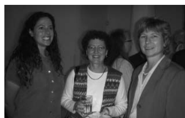
Panel discussion on "Balancing Work and Family Life" (top) and photos at the reception, held at the Women's Basketball Hall of Fame in downtown Knoxville (middle, bottom).