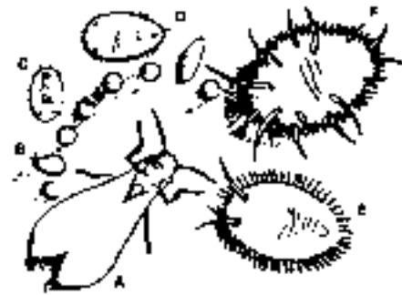
Life cycle of the greenhouse white fly. A, Adult. B, Eggs. C-E, Nymphs. F, Pupa.

After hatching, young nymphs (immatures) crawl about the plant for a few days, then settle down to feed. At this point, they insert their mouthparts into the plant tissue to feed. They then remain motionless until maturity. Nymphs are flattened and scale-like in appearance. A fringe of waxy material radiates outward from their bodies. This fringe is made of thick waxy plates or fine strands, depending on the species. The nymphal stage requires three to four weeks before pupation.