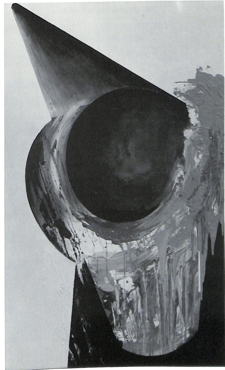
"Untitled" Acrylic & oil on canvas 45"x 75" 1988