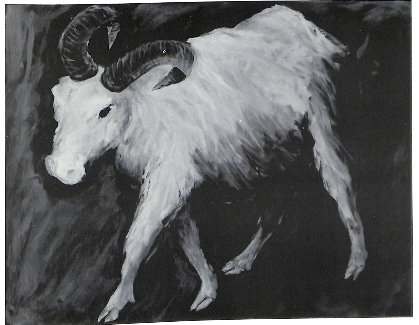
"Goat-Unnamed" oil 36"x 48" 1988