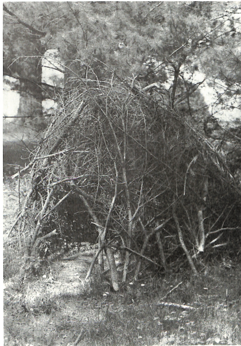
"Secluded Temple", hemlock sticks, 6' x 10', 1986