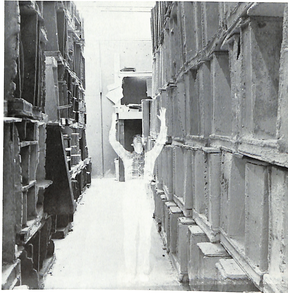
Cultural Barriers , clay, 8' x 17', 1985

"Student Show", Art Gallery, Andes Uni- versity, Merida, Venezuela, 1979