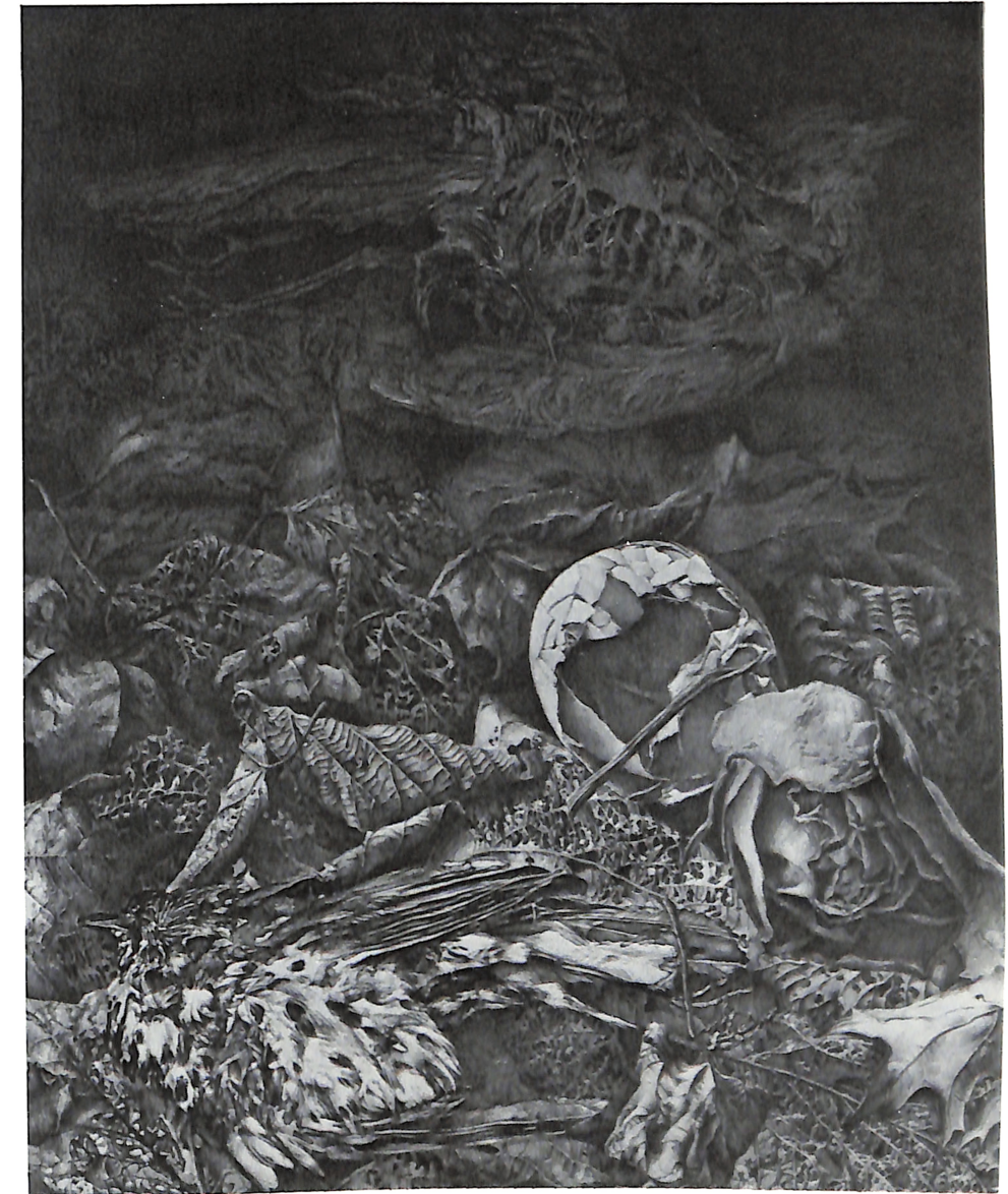
Untitled , lithograph, 22" × 17½", 1984

Awards and Exhibitions: "North Dakota Print and Drawing Annual", University of North Dakota, Grand Forks, 1985 "17th Annual National Works On Paper Competition", Dulin Gallery of Art, Knox- ville, TN, 1985 "Boston Printmakers 37th National Exhibi- tion", Rose Art Museum, Brandeis Univer- sity, Waltham, MA, 1984 "7th Annual North Carolina Print and Drawing Exhibition", Spirit Square Arts Center, Charlotte, NC, 1984 "Knoxville Avanti", Dulin Gallery of Art In- vitational, Knoxville, TN, 1983 "36th Annual Student Competition", Uni- versity of Tennessee, Knoxville, Materials Award, 1983