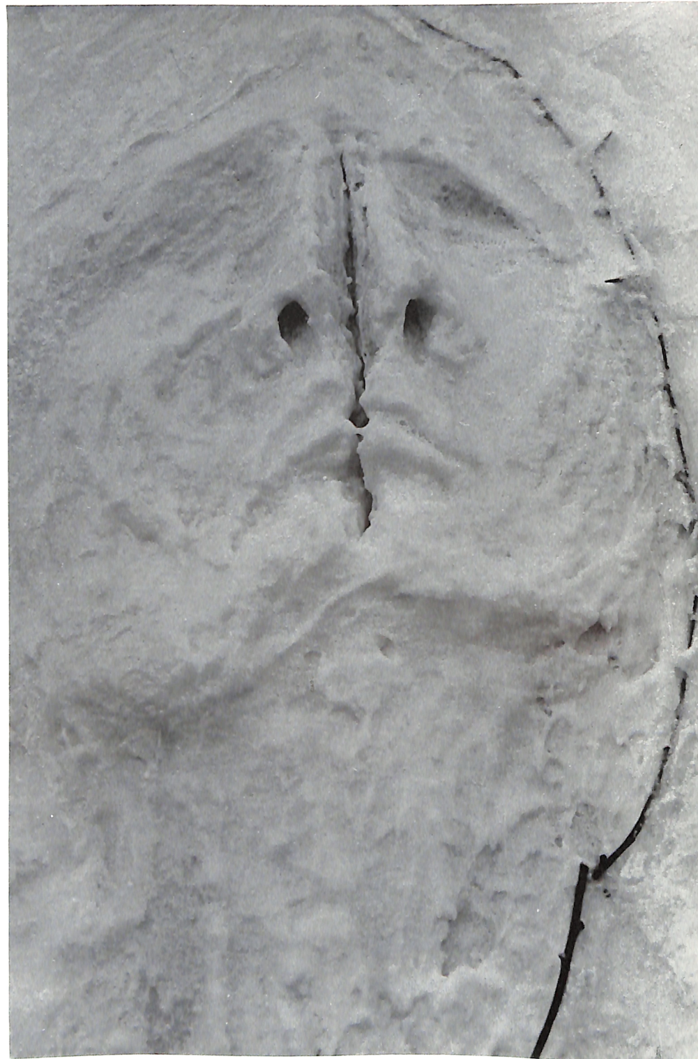
Untitled, mixed media, 16½" x 12½", 1985

Born: Melbourne, Australia B.F.A., University of Houston, Texas, 1977