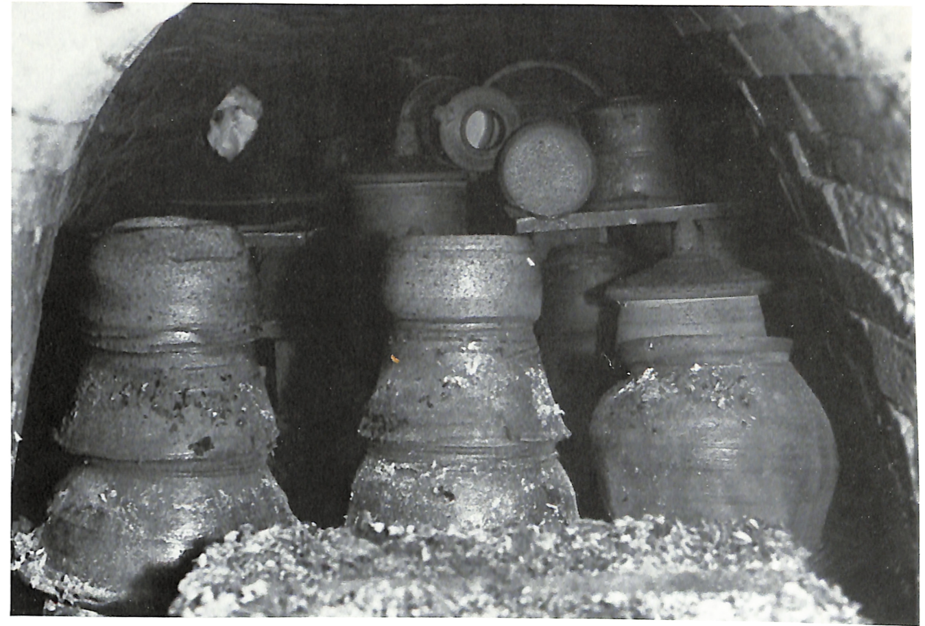
Kiln Opening, ceramics