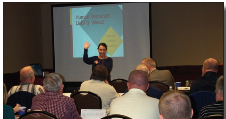
EOA participants ask questions and interact with other officials while getting the facts straight from experts.

"It's always easy to tell if someone has been through an EOA because they have a keen awareness of the broader set of responsibilities that go along with community governance, as opposed to the singular agenda they may have been elected to resolve. Many, many times you'll hear participants say, 'I wish my whole board were here.'"