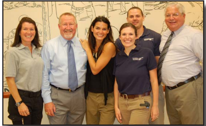
Angie Harmon, center, with National Forensic Academy staff.