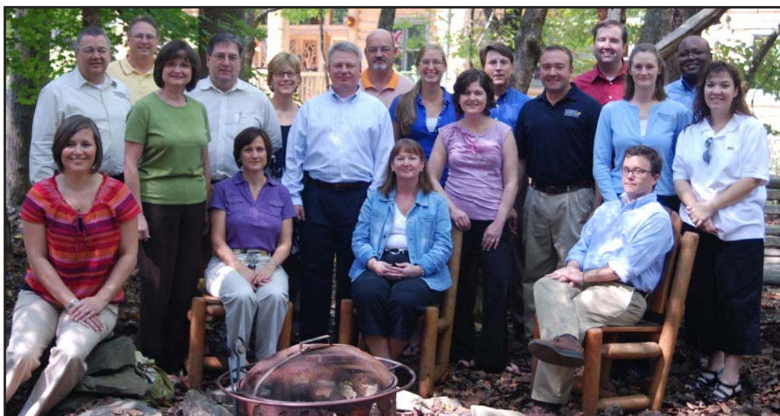
Left: 2010 IPS Leadership Academy participants