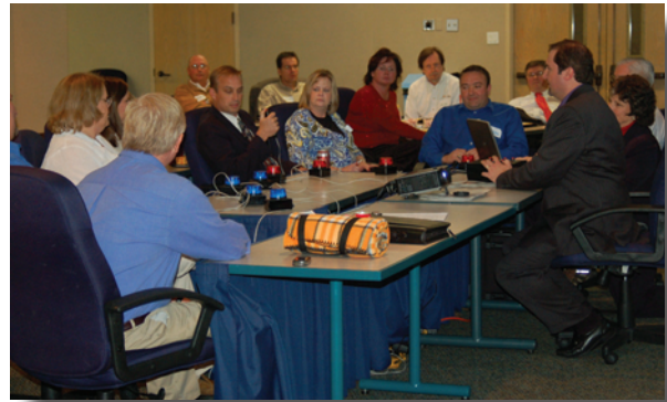
IPS employees learn how to best work with all generations in order to be a more efficient and effective agency for Tennessee and beyond.

There are presently more generations represented in the current workforce than at any other time in American history.