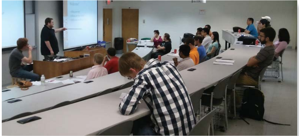
The Graduate Physics Society welcomed new students into the program this fall with an informational session to answer questions about coursework, teaching duties, and grad student life in UT Physics.