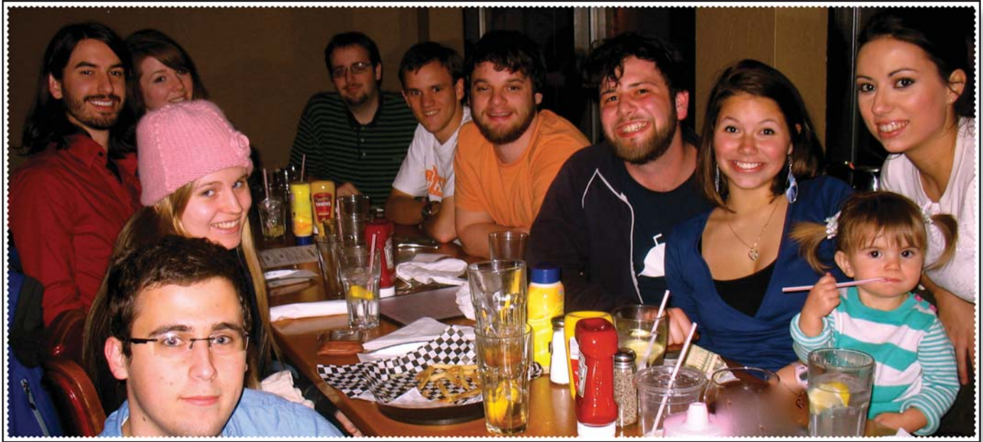
The Society of Physics Students enjoyed a get-together at the Copper Cellar Restaurant in February.