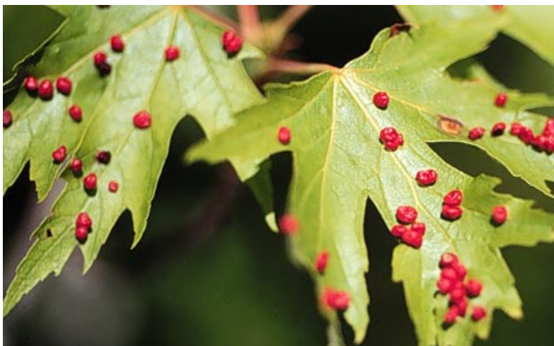
Maple bladder gall

* Not for use on residential home lawns or residential ornamentals.