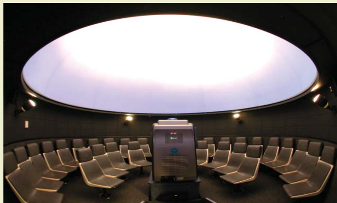
A planetarium at The Science Center in St. Petersburg, Florida, similar to the one envisioned in our department.

into other areas of astrophysics, cosmology, or even observational astronomy. An endowed chair is a large monetary commitment, so we are also looking for donors for junior level chairs, where the yield from the endowment would be used for a substantial salary increase and research funds for an outstanding junior level professor.