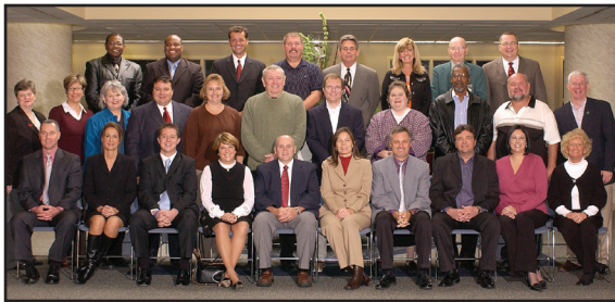
Three IPS employees were among the graduates of the 15th annual Local Government Leadership Program (LGLP).

Since its inception in 1991, there have been more than 380 graduates of the LGLP.