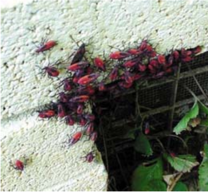
Figure 6. Boxelder bugs massing on a foundation wall. Immatures are red with black wing pads.

vacuuming, vacuum cleaner bags should be placed in a plastic bag and the bag sealed. The bugs can then be destroyed or the sealed plastic bag can be placed in a tightly-sealed outdoor garbage can.