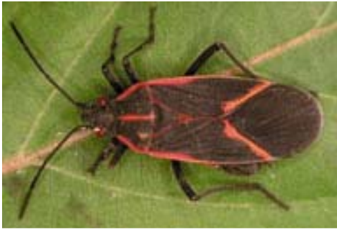
Figure 1. Adult boxelder bug. Boxelder bugs feed primarily on the seed-bearing boxelder trees by sucking sap from the leaves, tender twigs and developing seeds. Occasionally, they have been observed feeding on silver maple, other maples, ash, plum, cherry, apple, peach and grape, causing some scarring or dimpling of fruits. (Credit: E&PP, UT)

These insects hide in cracks and crevices in walls, in door and window casings, around foundations, in stone piles, in tree holes and in other protected places. On warm days during winter and early spring, they sometimes appear on light painted surfaces outdoors on the south and west sides of the house, resting in the sun.