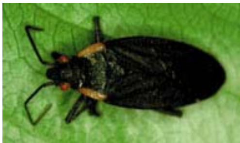
Figure 3. Adult red-shouldered bug. In Tennessee, red-shouldered bugs have been found feeding on seeds of goldenrain tree; however, at this time, we are uncertain of all the plants on which this bug may feed.