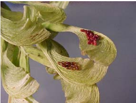
Figure 2. Red boxelder bug eggs on a boxelder samara.

Boxelder bugs feed primarily on the seed-bearing boxelder trees by sucking sap from the leaves (Figure 4), tender twigs and developing seeds (Figure 5). Occasionally, they have been observed feeding on silver maple, other maples, ash, plum, cherry, apple,