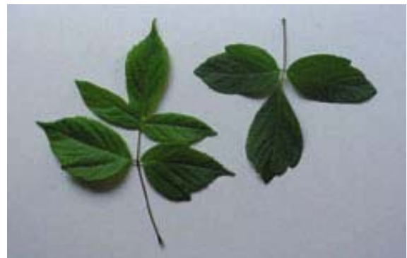
Figure 4. Boxelder compound leaves.