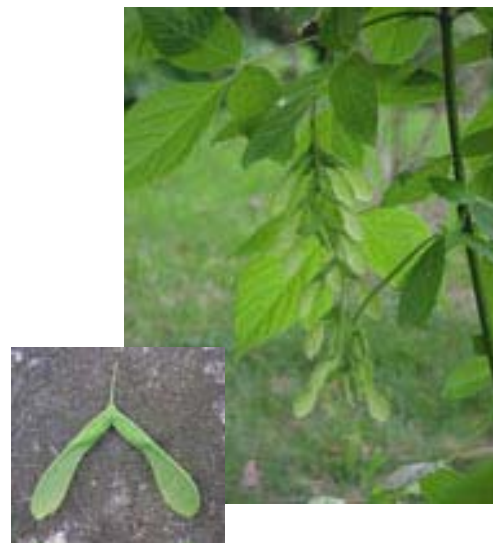
Figure 5. Boxelder seed panicle with close up of samara (inset).

In early autumn, adult and large nymphal boxelder bugs congregate in large numbers, primarily on the bark of boxelder trees, and then begin migrating to a place for overwintering. Only adults overwinter, moving to hibernation sites either by crawling or flying.