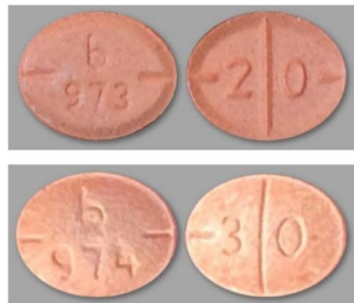
Real (top) and counterfeit (bottom) Adderall tablets

In the Middle East, the most popular illicit substance is a counterfeit stimulant known as “Captagon.” While it is commonly consumed by militant groups, it is popular among college-aged students and a