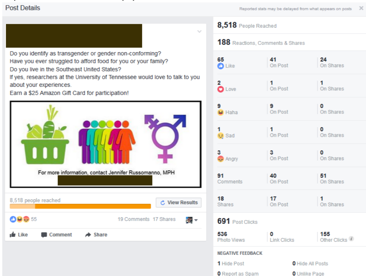
Figure 2. Cycle 1 advertisement Facebook summary report.