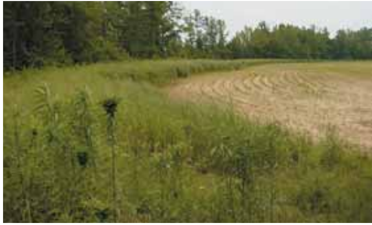
Establishing nwsg borders (>30 feet wide) can provide excellent nesting, brooding and escape cover around fields. Using this practice alone will help increase local populations of quail and various songbirds.

Nwsg can provide excellent forage for livestock and, when properly managed, can still provide quality nesting and brood-rearing habitat. Nwsg are attractive as a forage crop because nwsg produce the majority of their growth during the summer, when cool-season grasses produce relatively little. Yields of two to five tons per acre of nwsg forage can be expected, depending on rainfall, soil type and other conditions. Crude protein can be as high as 16–17 percent, but normally is 8–12 percent at optimum harvest. Just as with any forage species, nutrient content of nwsg is influenced by plant maturity. As plants mature, percent protein and digestible energy decrease, while fiber content increases. Maximum tonnage and high forage quality do not occur at the same time. From a practical standpoint, all grass hay should be cut just before seedheads begin to emerge, whether warm- or cool-season.