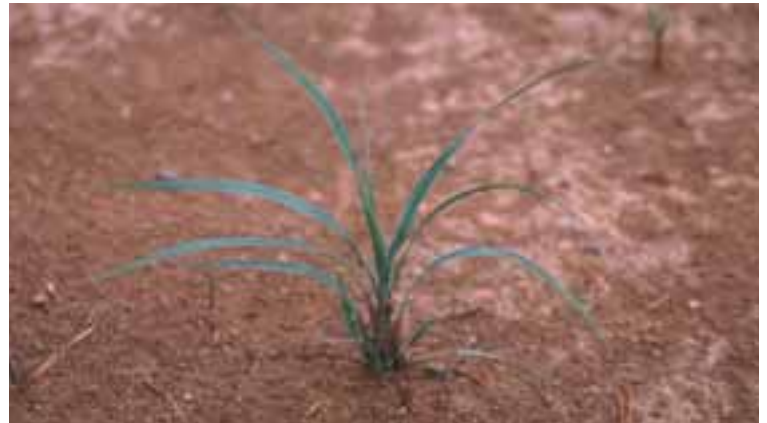
This is what you are looking for! This is a big bluestem seedling with its characteristic “fountain” appearance. Note the bare ground and lack of weeds germinating around the seedling. This is what should be expected from a properly applied pre-emergence herbicide.

Nwsg develop relatively slowly during the year of establishment. Most of the first-year plant growth is root development. Leaf and stem growth may not reach more than 2 feet high by the end of the first growing season. Typically, it is not until the second growing season that most nwsg develop considerable aboveground biomass, flower and produce seed. However, if the correct planting procedures are followed and soil moisture is not limiting, excellent growth will occur during the year of establishment, with considerable aboveground biomass and extensive flowering.