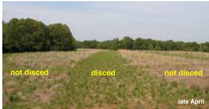
This field is being managed by discing alternate strips in winter. This will provide brooding cover adjacent to nesting cover.

Another management practice often necessary is herbicide applications. Strip spraying a grass-selective herbicide (e.g., Select ® ) in late April using alternate spray nozzles can decrease grass density, create additional open space at ground level and stimulate the seedbank. Strip spraying should be conducted in patterns similar to those recommended for discing. Spot spraying or broadcast spraying other selective herbicides (see Appendix 1) may be necessary to reduce several problem grasses (e.g., crabgrass, tall fescue) and forbs (e.g., sericea lespedeza, thistles), as well as woody competition (e.g., sweetgum, winged elm). In all cases, herbicide labels should be read before use and followed closely with regard to restrictions, precautions, rates, recommended tank mixtures, surfactants and sprayer-cleaning recommendations.