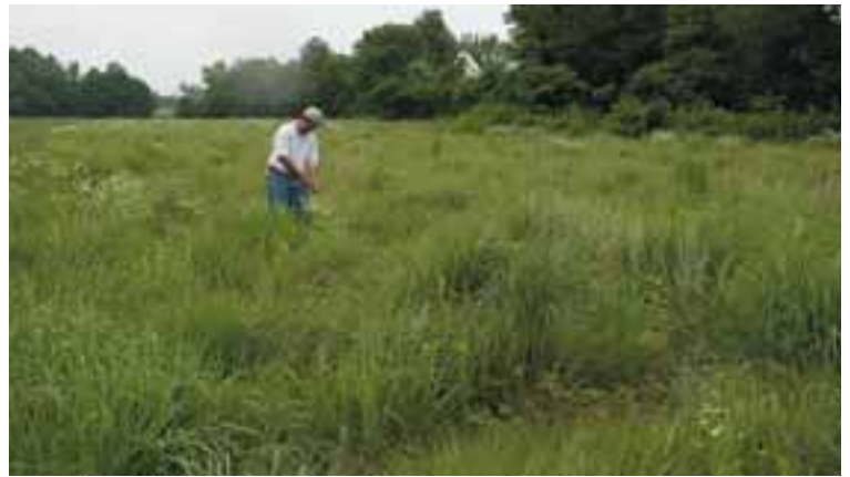
Short mixtures of nwsg usually are dominated by little bluestem, broomsedge and/or sideoats grama. These stands can provide excellent cover for nesting, brooding and foraging.

Species and mixtures for livestock forage are generally determined by preference and potential problems with competitive weeds. For example, pure stands of switchgrass or eastern gamagrass can provide excellent forage for livestock. However, if crabgrass and/or johnsongrass are prevalent, a mixture of big and little bluestem and indiangrass might be a better choice, because an imazapic herbicide can be used to help ensure successful establishment.