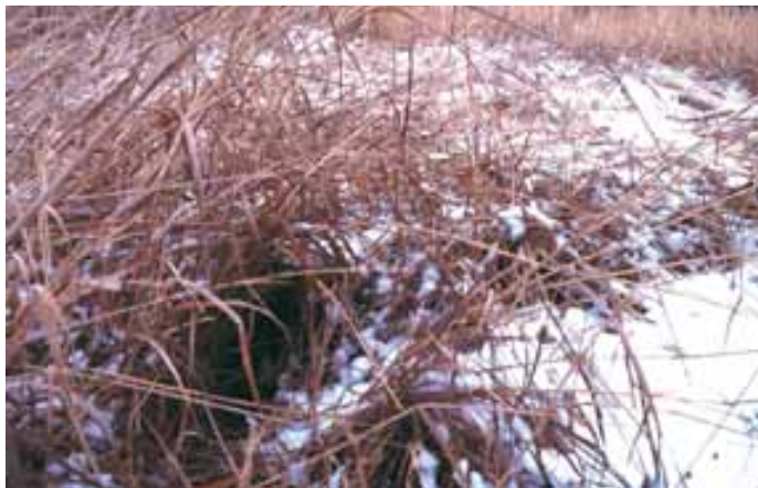
Taller nwsg species (e.g., big bluestem, indiangrass and switchgrass) provide excellent cover in winter because their stems “lodge,” creating usable space for wildlife. Here, a rabbit finds a winter home. This type of structure is not available in cool-season grass fields.

is at a premium. Tall nwsg, such as big bluestem, indiangrass and switchgrass, are especially valuable as their stems “lodge” (remain somewhat upright, leaning against each other), continuing to provide cover even after winter rains, snow and wind. Deer seek out nwsg fields on cold, clear days because they can remain hidden in the tall grasses, yet are able to absorb the sun’s warm rays. In low-lying bottomlands that periodically flood in winter, fields of switchgrass (especially the Kanlow variety) can attract large numbers of ducks when shallowly flooded.