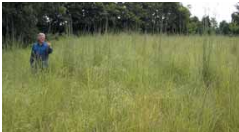
Tall mixtures of nwsg usually include some combination of big bluestem, indiagrass and switchgrass. These stands can provide excellent cover for nesting, brooding and foraging, as well as winter and escape cover.

Tall mixtures provide cover for ground-nesting birds, as well as those that nest above-ground (e.g., dickcissel, field sparrow, Henslow's sparrow and red-winged blackbird). Tall mixtures also provide excellent cover for brood rearing and escaping predators.