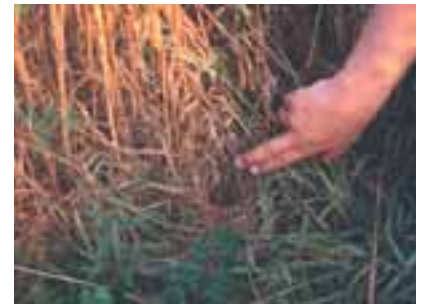
Bobwhite quail nest situated at the base of a 2-year-old bunch of broomsedge. Note how the senescent leaves from last year are used to construct the nest.