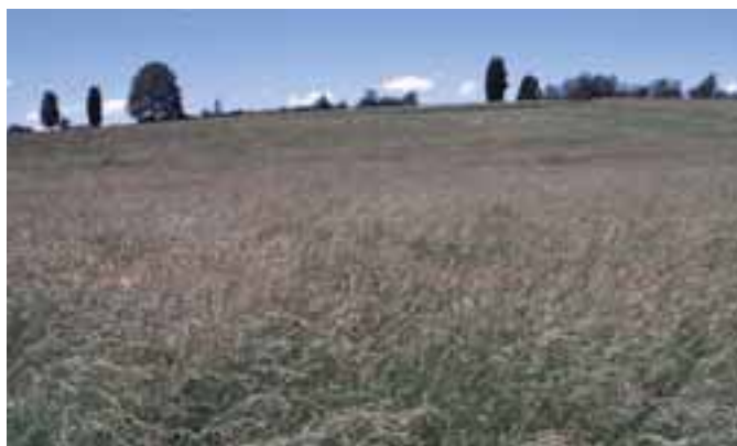
Fields of tall fescue are common throughout the Mid-South. This is poor wildlife habitat and, for many species, it might as well be covered in asphalt.

There are many problems associated with tall fescue and other perennial cool-season grasses, both for wildlife and livestock. Problems for livestock are associated with an endophyte fungus found within tall fescue that is highly toxic. Cattle consuming tall fescue (either grazing or as hay) often experience poor weight gains, reduced conception rates, intolerance to heat, failure to shed the winter hair coat, elevated body temperature and loss of hooves. Problems with horses are more severe, especially 60–90 days prior to foaling. Fescue toxicity in horses often leads to abortion, prolonged gestation, difficulty with birthing, thick placenta, foal deaths, retained placentas, reduced (or no) milk production and death of mares during foaling. As a forage, tall fescue and other perennial grasses (e.g., orchardgrass) are