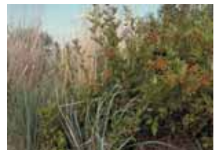
Forbs (e.g., blackberries, partridge pea and ragweed) provide excellent brooding cover and a source of seed for bobwhites and other species.