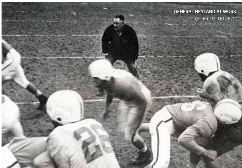
GENERAL NEYLAND AT WORK.