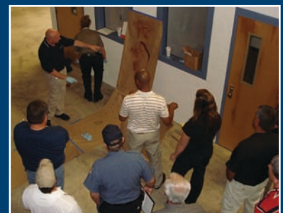
Officers study blood spatter as part of the Crime Scene Management course.

In December 2006, NFA staff, along with LEIC's Curriculum Development Team, met with subject matter experts from across the country to develop the new course.