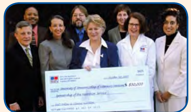
Hill's representatives make presentation during event celebrating UTCVM's first Hill's Fellow